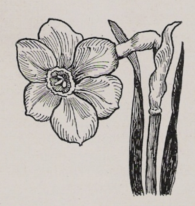
Division 9. Poeticus Varieties