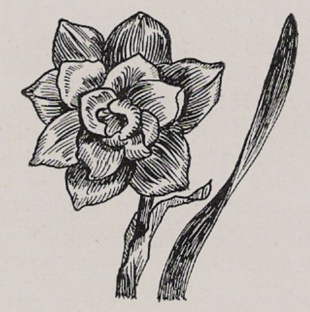
Division 10. Double Varieties

Division 11. Various To include Narcissus Bulbocodium, N. cyclamineus, N. triandrus, N. juncifolius, N. gracilis, N. Jonquilla, N. Tazetta (wild forms), N. viridiflorus, etc.