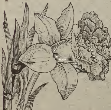
Double Narcissus (Van Sion).

If ordered by mail, add 15c. per dozen for postage.