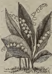
Lily of the Valley.

The most beautiful and deliciously fragrant Spring flowering plant. It is neat and chaste in its growth, and possesses every quality to render it a universal favorite; makes a fine pot plant.