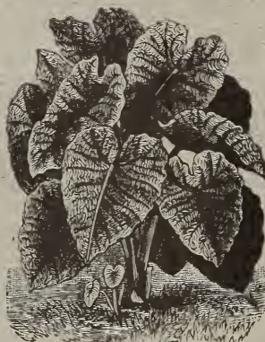
Caladium Esculentum (Elephant's Ears).

up several stems when well grown, the flowers are produced in profusion. It is very easily grown, bears pure white flowers, with a lemon or orange cup. The Chinese method is as follows: Fill a bowl, or some similar vessel, with pebbles, in which place the bulb, setting in about one-half its depth, so that it will be held firmly, then fill with water to the top of the pebbles and place in a warm, sunny window. Each, 10c.; per doz., $1.00.