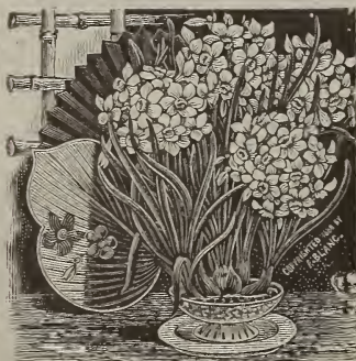
Chinese Sacred Lily.

This variety is the Tazetta , or bunch flowering Narcissus , and is the sort grown by Chinamen for use in their New Year festivals. The bulbs are very large, averaging three to four inches in diameter, and as they throw