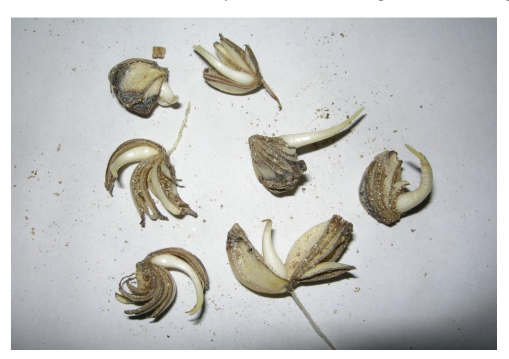
Figure 4: Little bulbs after three months in the heat box

For chips of Hawera it was found out that they form little bulbs with a size of 0,3 mm within 15 days at 20 centigrade. After 7 days, the bulbs should be much smaller. The chips were washed under flowing water and given in penetrable nylon bags to a solution of 1 l water with 10 mg Oryzalin solved in 2 ml DMSO (Dimethylsuloxide) for 48 h at 20 centigrade. The solution with the chips was agitated with an underwater pump. The container was assembled within a fridge at 17 centigrade, because the pump otherwise heats up the solution to more than 20 centigrade. After this operation, the chips were held in agitated clear water for 24 hours, taken out and treated with the fungicide solution. Thereupon they were filled into plastic bags together with moist vermiculite and kept at 20 centigrade for three months within a heat box. During this time the little bulbs become bigger and in the end (Fig.4) they were planted into a peat compost (called TKS1 in Germany) at a temperature of 15 centigrade for the first month, 10 centigrade for the second, and 8 centigrade for the third. Then in March and later the planting bed under glass has not been heated. The twin scaling or chipping is made during August and the early part of September with the best results. The chips should have a weight of about one gram.