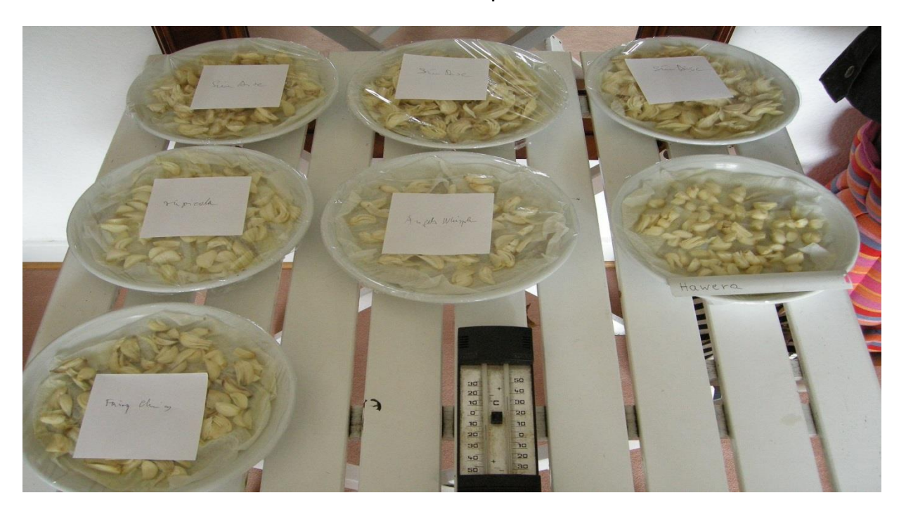
Figure 3. Storing chips for seven days

The following procedure has been used: The bulbs for chipping were hot water treated for 4 hours at 45 centigrade. Thereafter they were placed for 15 minutes within a 0,2 % solution of sodium hypochlorite in water. The fabricated chips were covered for 15 minutes with a fungicide solution of 20 mg Maneb, 20 ml Chlorthalonil, and 20 ml Carbendazim per liter. Then the chips were hold for 7 days at 20 centigrade (Fig.3). They were located on paper with wetted vermiculite underneath and covered with a plastic sheet.