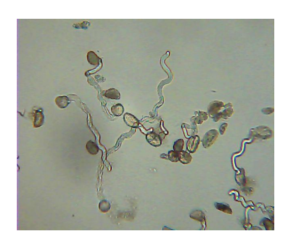
Figure 8. Pollen of the new Fairy Chimes