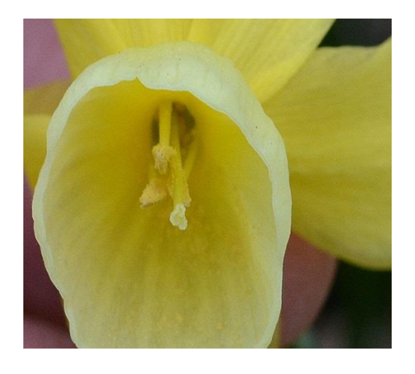
Figure 5. Hawera with pollen