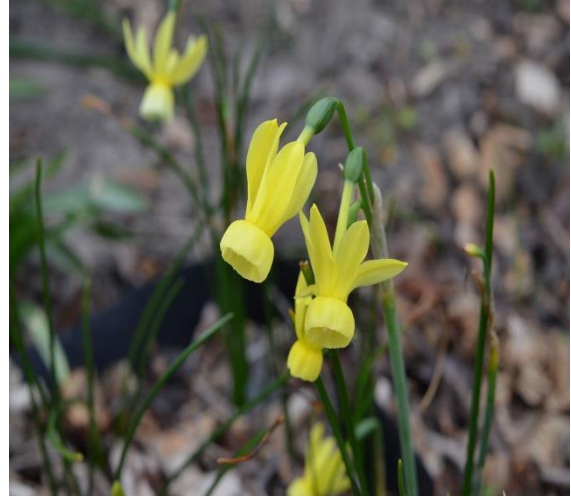
Figure 1. Transformed Hawera