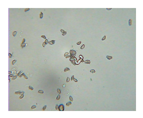
Figure 9. Unreduced sprouting pollen grain of the normal diploid Hawera