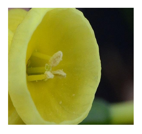
Figure 6. Fairy Chimes with pollen

About 60 to 70 % of the diploid pollen that measures about 46 \mu m for the short axis sprouted (Fig. 7 and Fig. 8). For the normal diploid Hawera I found one flower only of 20 plants with very few unreduced pollen grains (Fig. 9) An earlier provisional identification as tetraploid or mixoploid for example by the size of the leaves was not possible because the little bulbs are of different size and generate also plants of different size. The transformation rate was about 1 to 3 %. I am waiting for some further tetraploid or mixoploid plants: Sun Disc, Sun Dial, Angels' Whisper, N. rupicola, N. assoanus, N. cordubensis, and N. henriquesii have been treated for chromosome doubling.