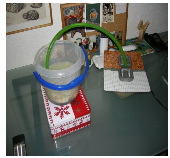
Figure 10. Wetted chips in air