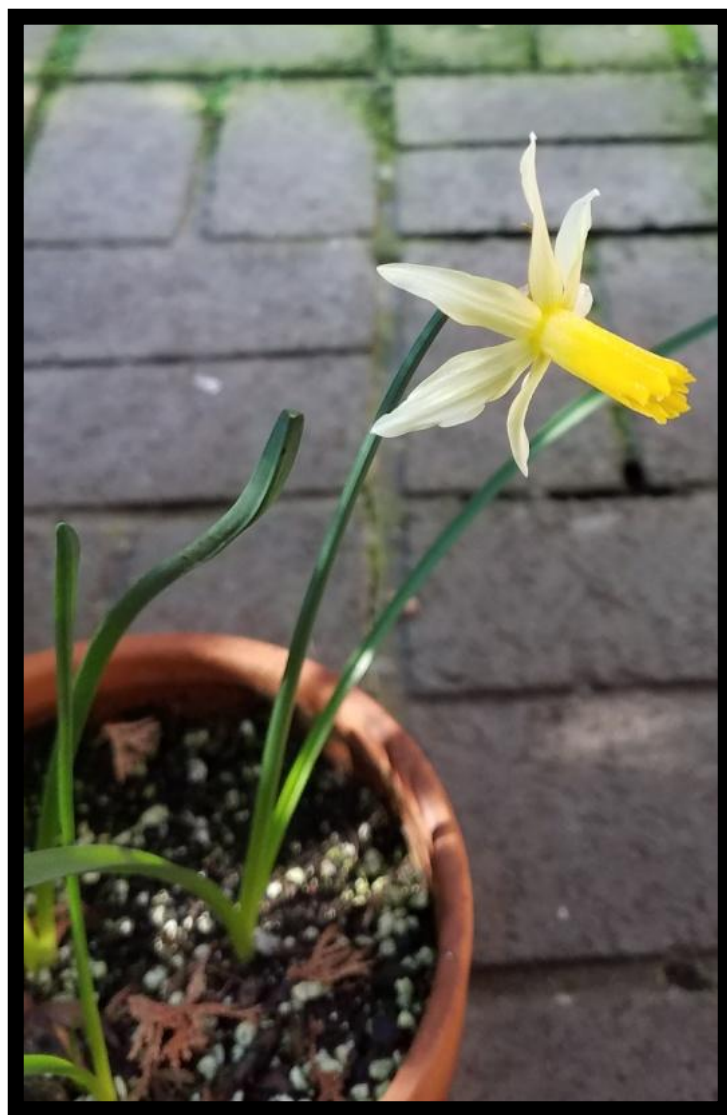
Gipsy Queen x N. cyclamineus