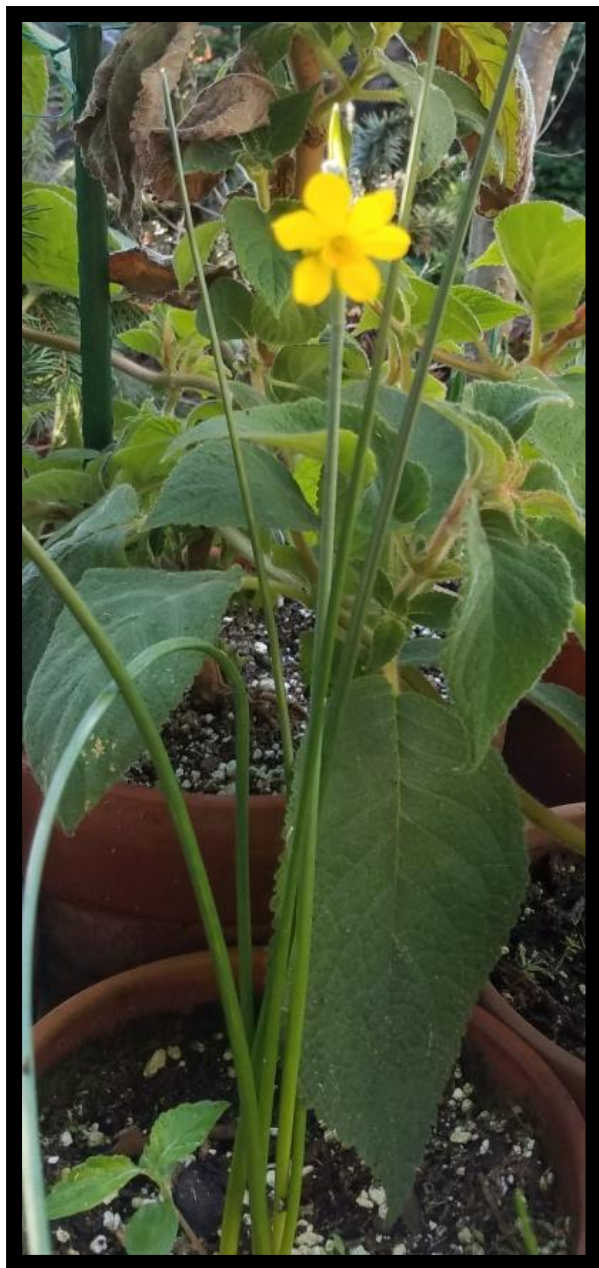
Higgins 09/05M 7 Y-Y (Clay Higgins)

The following daffodils are currently blooming in my garden in early February 2018.