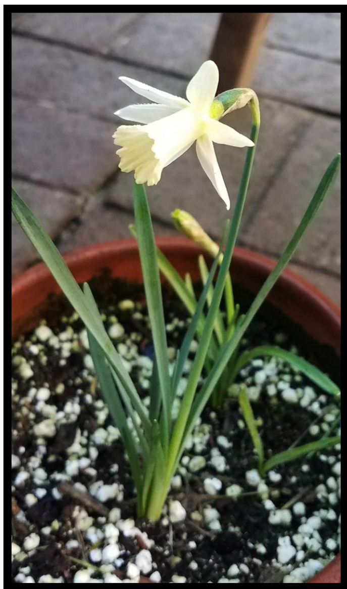
Sugared Fruit 1 WW (Walter Blom)