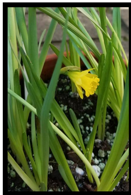
Likely Lad 1 Y-Y