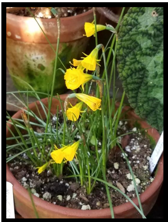
N. bulbocodium var. tenuifolius seedling

The following daffodils are currently blooming in my garden in early February 2018.