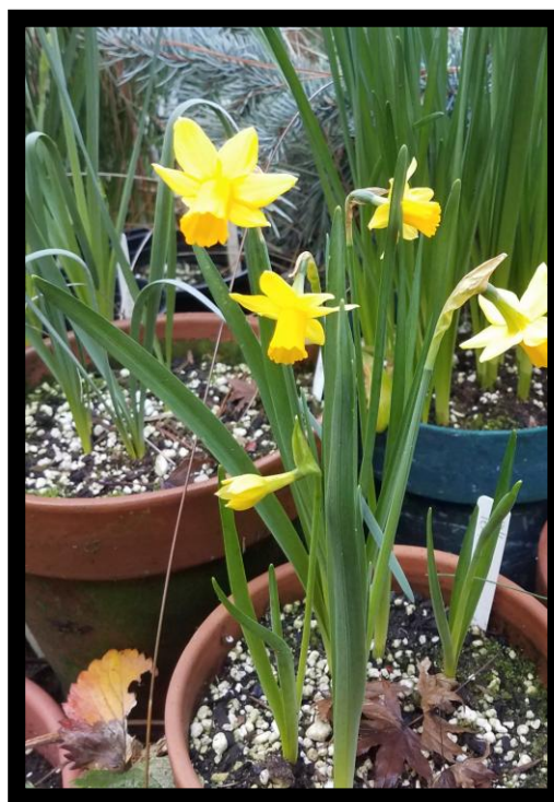
Link Tete A Tete x N. calcicola (Helen Link)