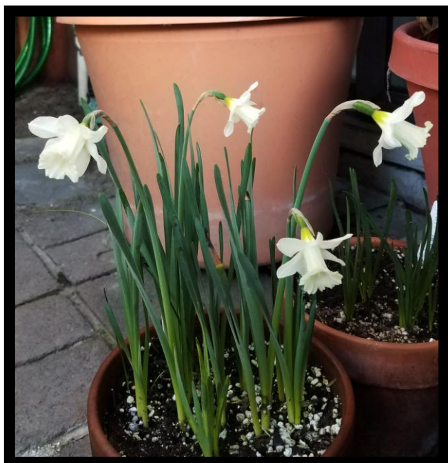
Oakwood Tyke 1 W-W (John Reed)