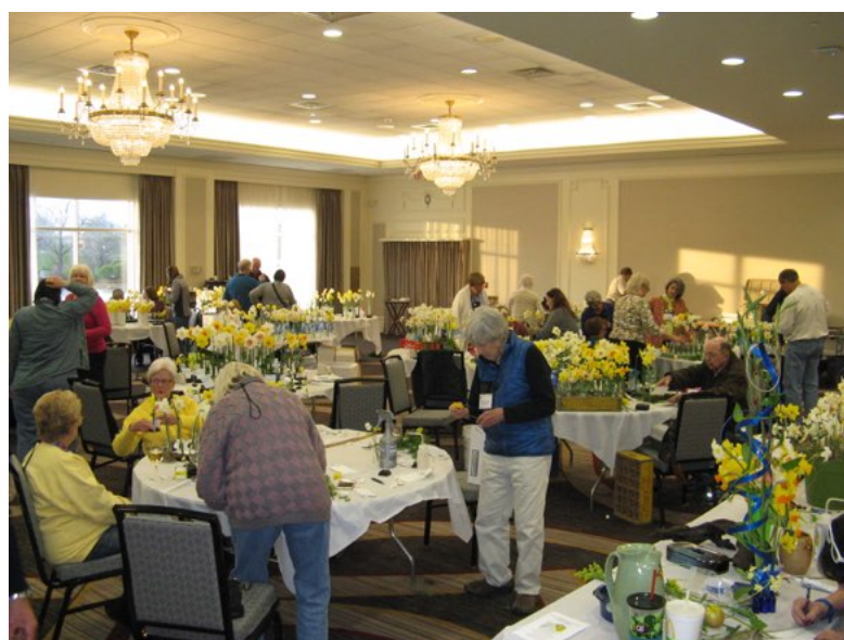
Exhibitors busy staging their blooms