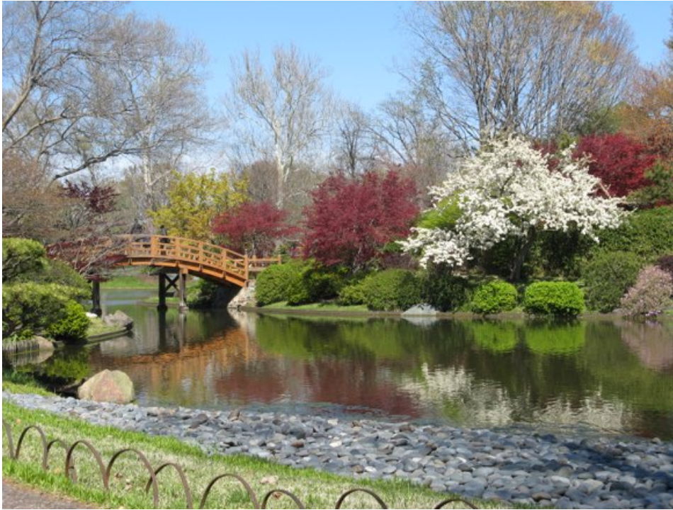
Missouri Botanical Gardens - a new vista round every corner