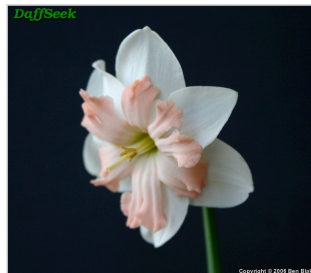
The Phantom Phantom

an apology to many customers and to you. If you received either of these misnamed bulbs and marked them when you planted them, shoot a photo when they bloom and we'll try to verify what they really are.