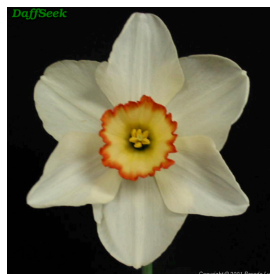
The Elusive Coral Light