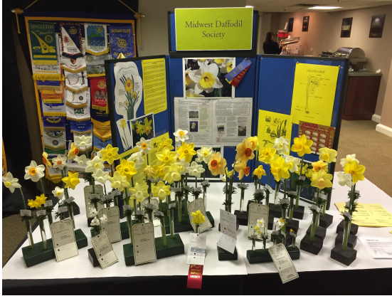
Our show winners also appeared at a Rotary Club, a Master Gardeners session, and a local garden club.