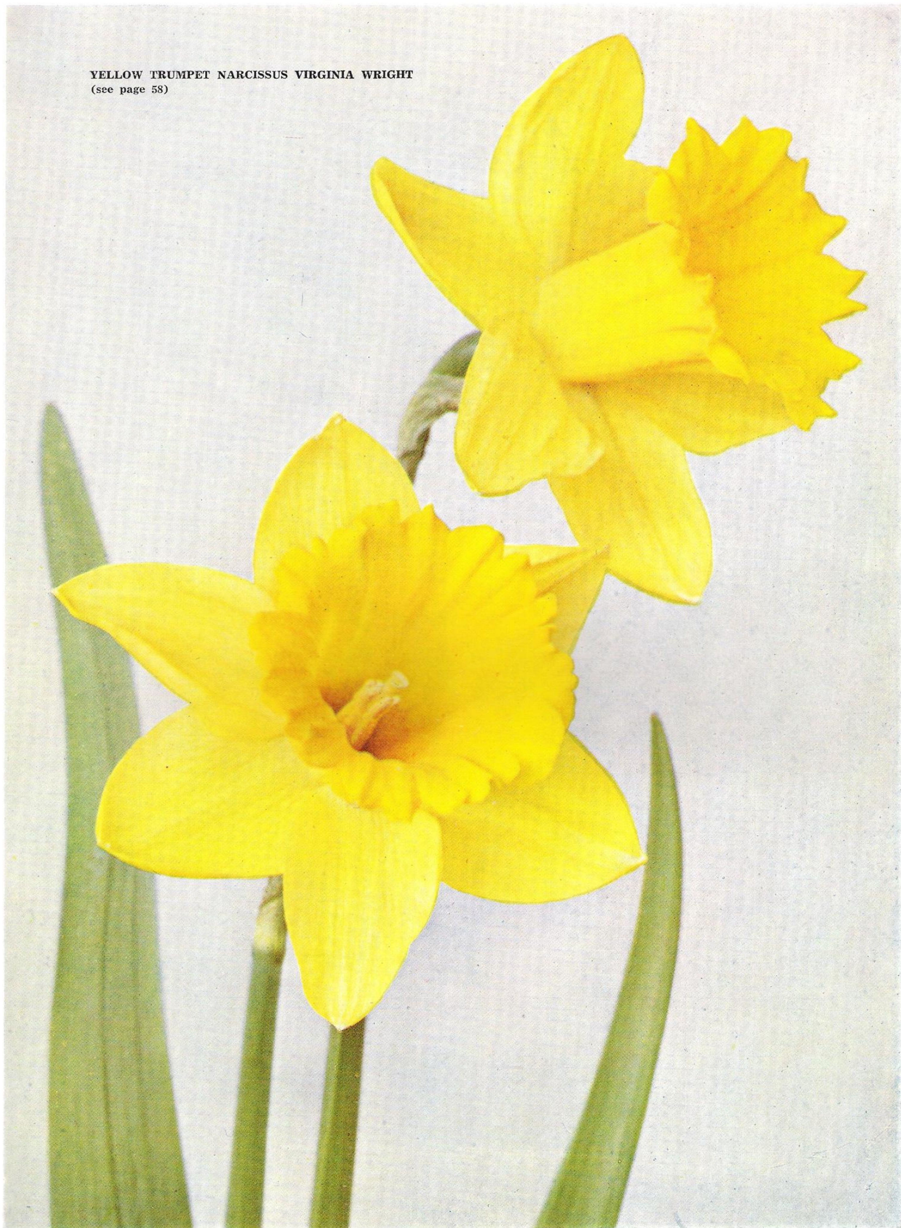
YELLOW TRUMPET NARCISSUS VIRGINIA WRIGHT (see page 58)