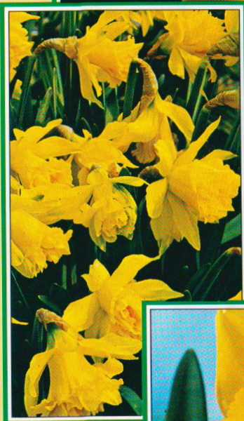
Van Sion — see page 17