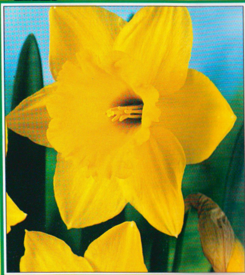
Carlton — see page 10