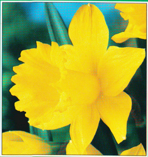
Magnifique — see page 9