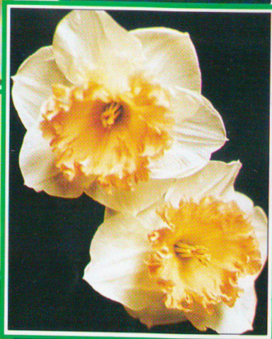
Pink Lace — see page 13