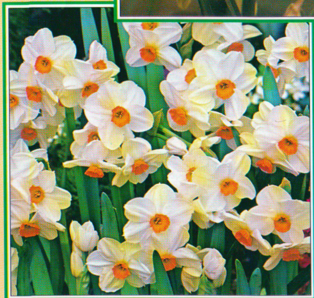
Geranium — see page 16