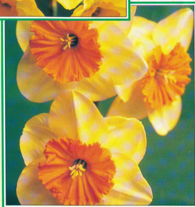
Tasmania — see page 11