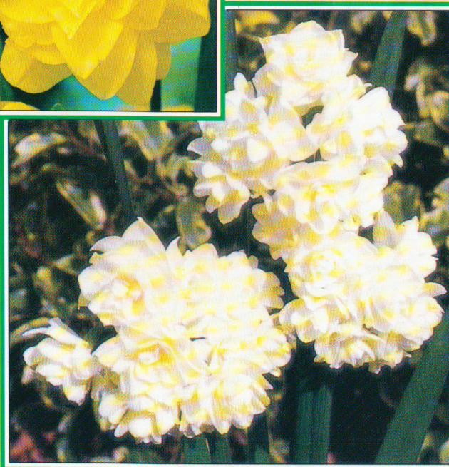
Jonquil Erlicheer — see page 15