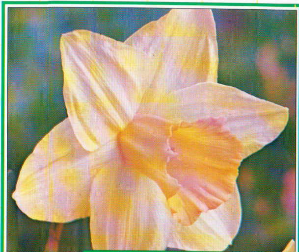
August Pink — see page 13