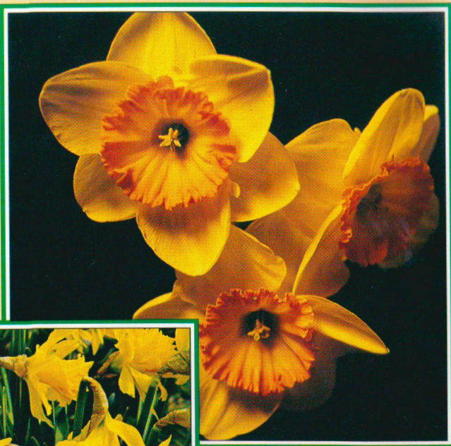
Star Affair — see page 11