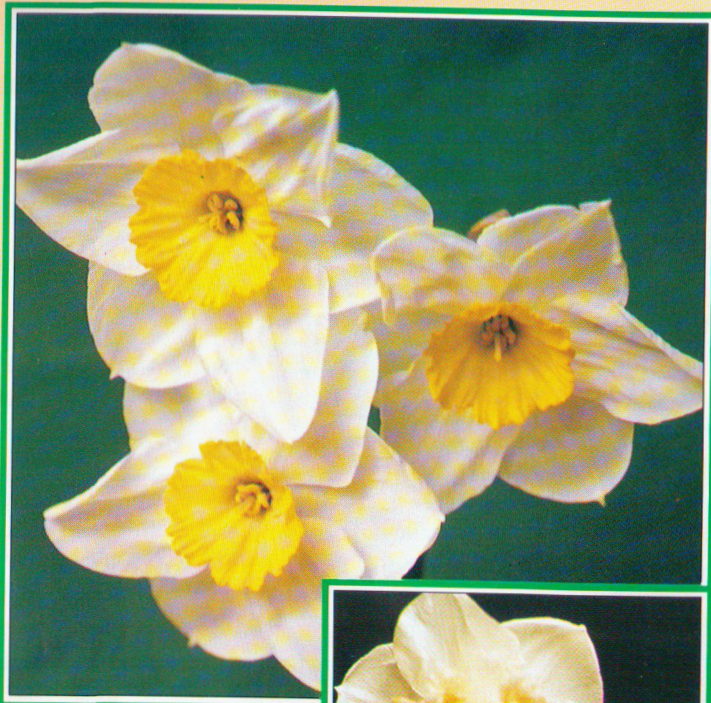
Star of Venus — see page 12