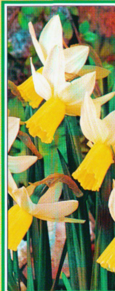
Dove Wings — see page 15