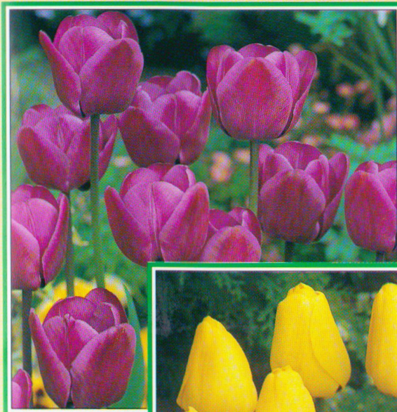
Golden Apeldoorn — see page 20