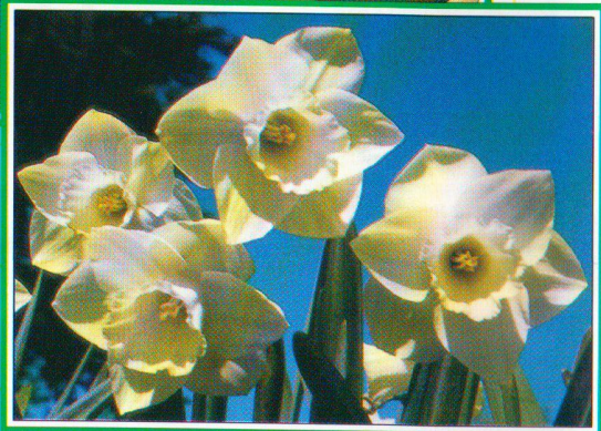
Rhapsody — see page 14