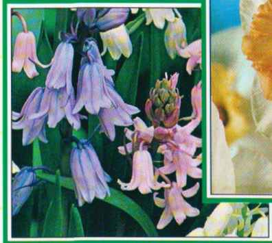
Scillas Pink and Blue — see this page