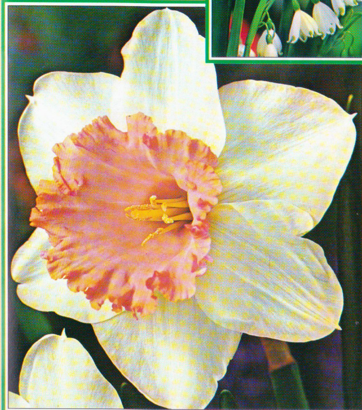
Pinkadel — see page 13