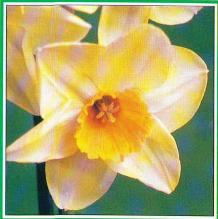
Fairy Wonder — see page 11