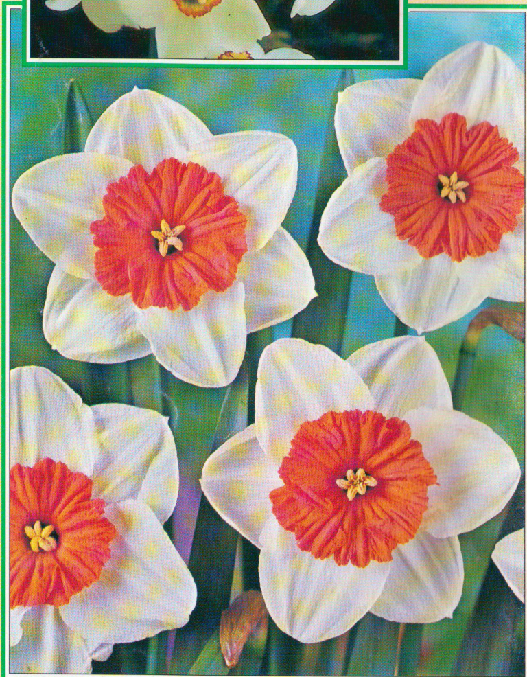
Professor Einstein — see page 12