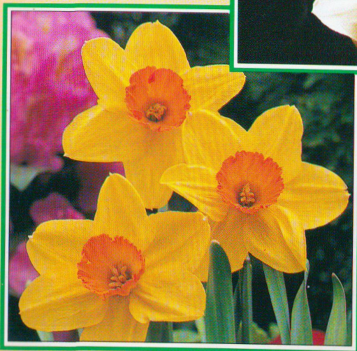
Illuminate — see page 11