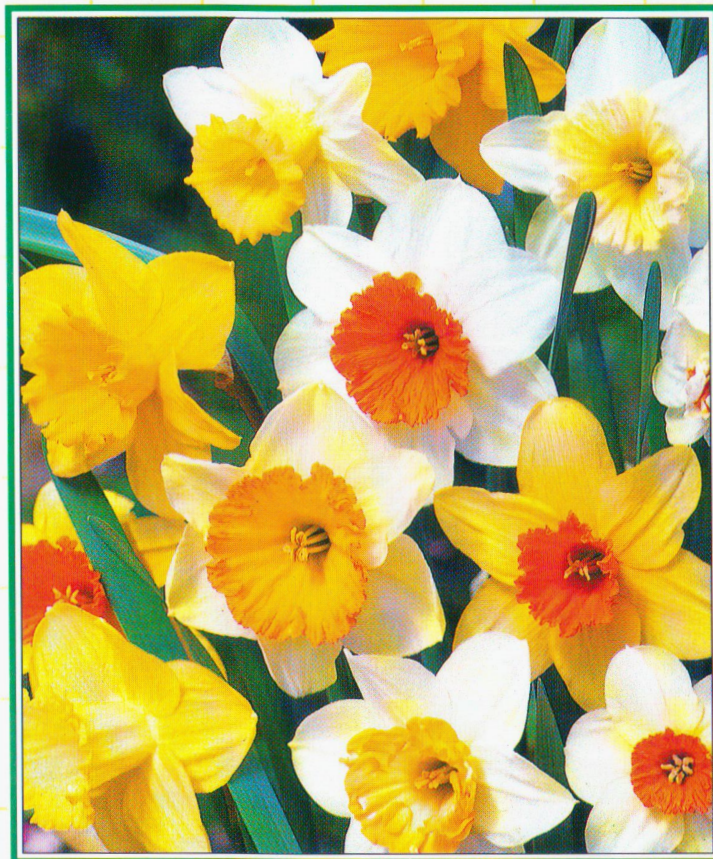
Mixed Daffodils— see page 22

SOHO 11W-Y A flower of bright colouring. The perianth is milky white while the large split cup is a bright shade of yellow. The perianth protrudes through the cup. Very vigorous grower. LATE . $6.00