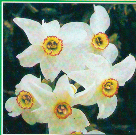
Poeticus recurvus — see page 22