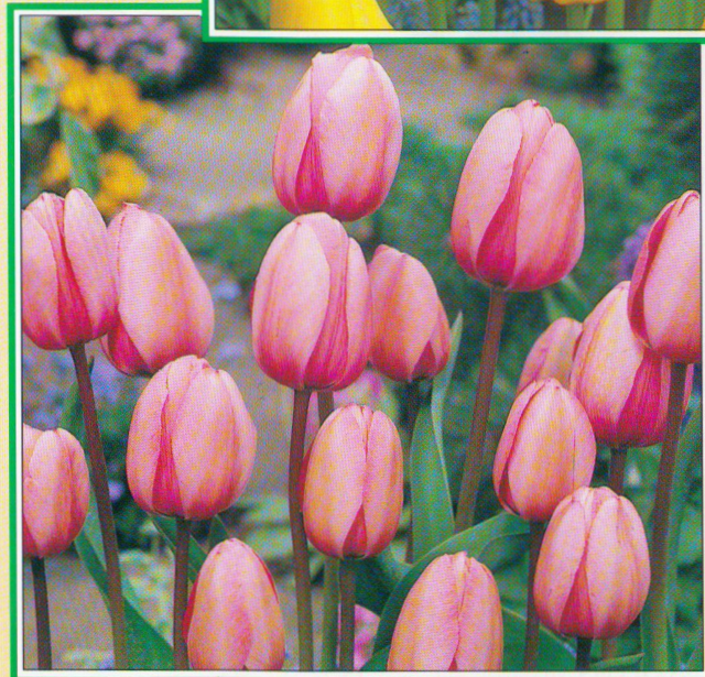
Pink Impressions — see page 20