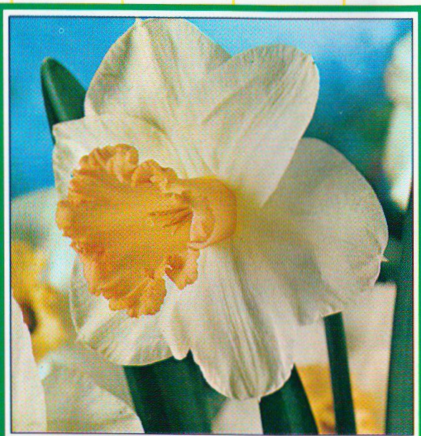
Mabel Taylor — see page 13

ROCK TULIP: SAXATILIS (The Satin Tulip) Lilac petals with a bright yellow base opening out in the sun. 3 to 5 flowers on a stem. Flowers very freely, good grower, ideal to plant under deciduous trees. Leave in the one spot for years. 3 bulbs for $5.00 (picture page 23)