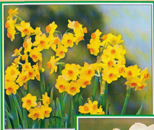
Silver Chimes — see page 16