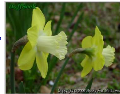
N. Daydream is a beautiful 'reverse bicolor' - every daffodil lover's garden needs some of these!

If you can donate bulbs to the Bulb Roundup, please let Edie Godfrey know in advance! Send her a list of cultivars and approximate quantity of bulbs before September 8th . Please bag your bloom-size