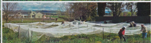
Daffodil enthusiasts at the Keira Bulbs plots during the Centenary daffodil event.