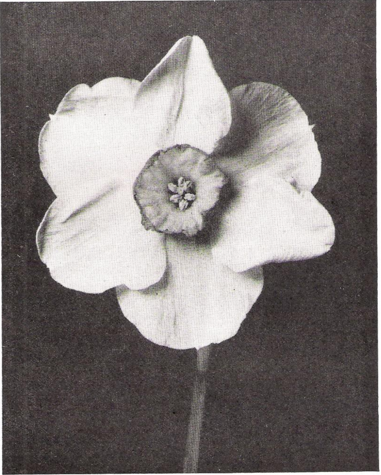
Lady Diana Manners — See Page 18

A wonderfully attractive flower that has leaped into popularity.