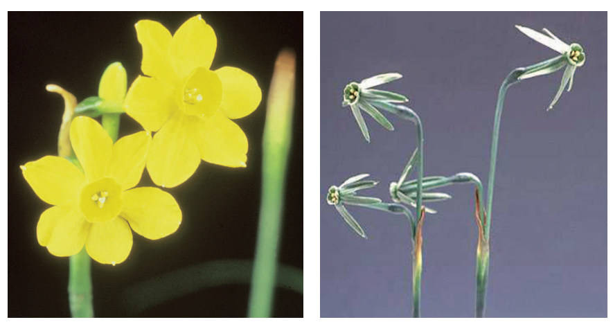
Figure 6. Narcissus jonquilla (LEFT) and N. viridiflorus (RIGHT), basal rotresistant species being exploited in narcissus breeding.