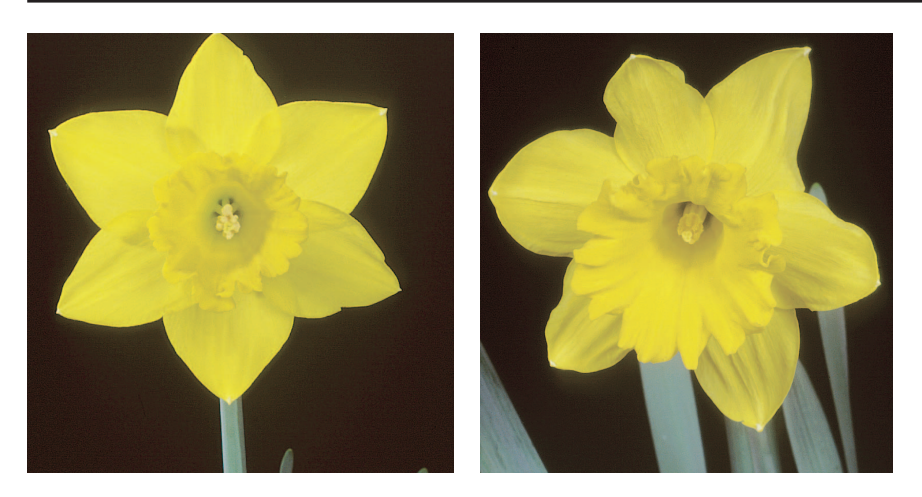
Figure 5. Two narcissus cultivars important in breeding – 'St Keverne' (LEFT) (with field resistance to basal rot) and 'Golden Harvest' (RIGHT) (highly susceptible).