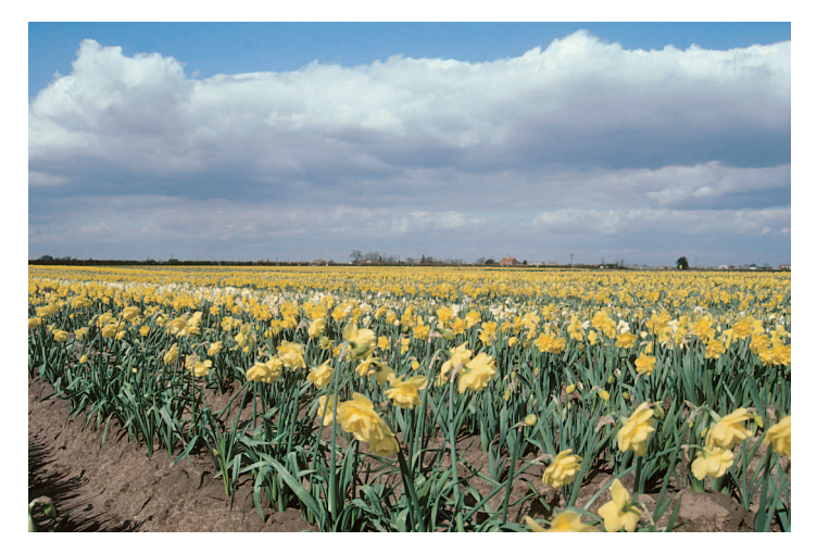
Figure 1. General view of a commercial daffodil crop.

'Neck rot' has symptoms similar to basal rot, but it starts at the top of the bulb rather than the bottom (Price and Linfield, 1981). A number of fungi have been considered as