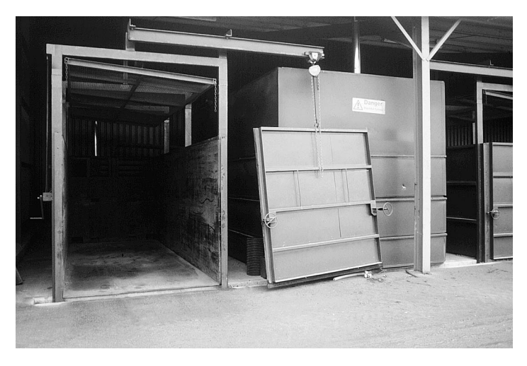
Figure 3. Hot-water treatment tanks: Bulk bins of bulbs are loaded into the tanks by a fork-lift truck, the door is secured and pre-heated water is pumped into the treatment tank from a holding tank.

Many growers utilise the HWT procedure to add fungicides (and sometimes an insecticide to control large