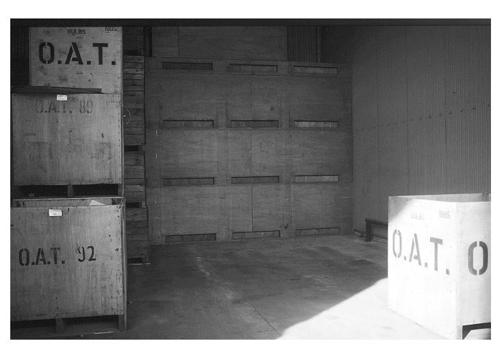
Figure 4. Letter box drying wall. Bulbs in one-tonne bulk bins (left) are placed against the drying wall (right background) which houses powerful fans. Air (at 35°C) is blown through the 'letter-box' openings into the pallet bases of the bins, and up through the bins to dry the bulbs in 2–3 days.

Once lifted, bulbs have to be cleaned, inspected (removing damaged and diseased bulbs and splitting up bulb