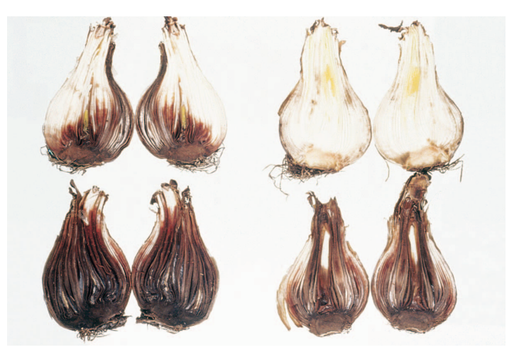
Figure 2. Basal rot symptoms - half bulb views.