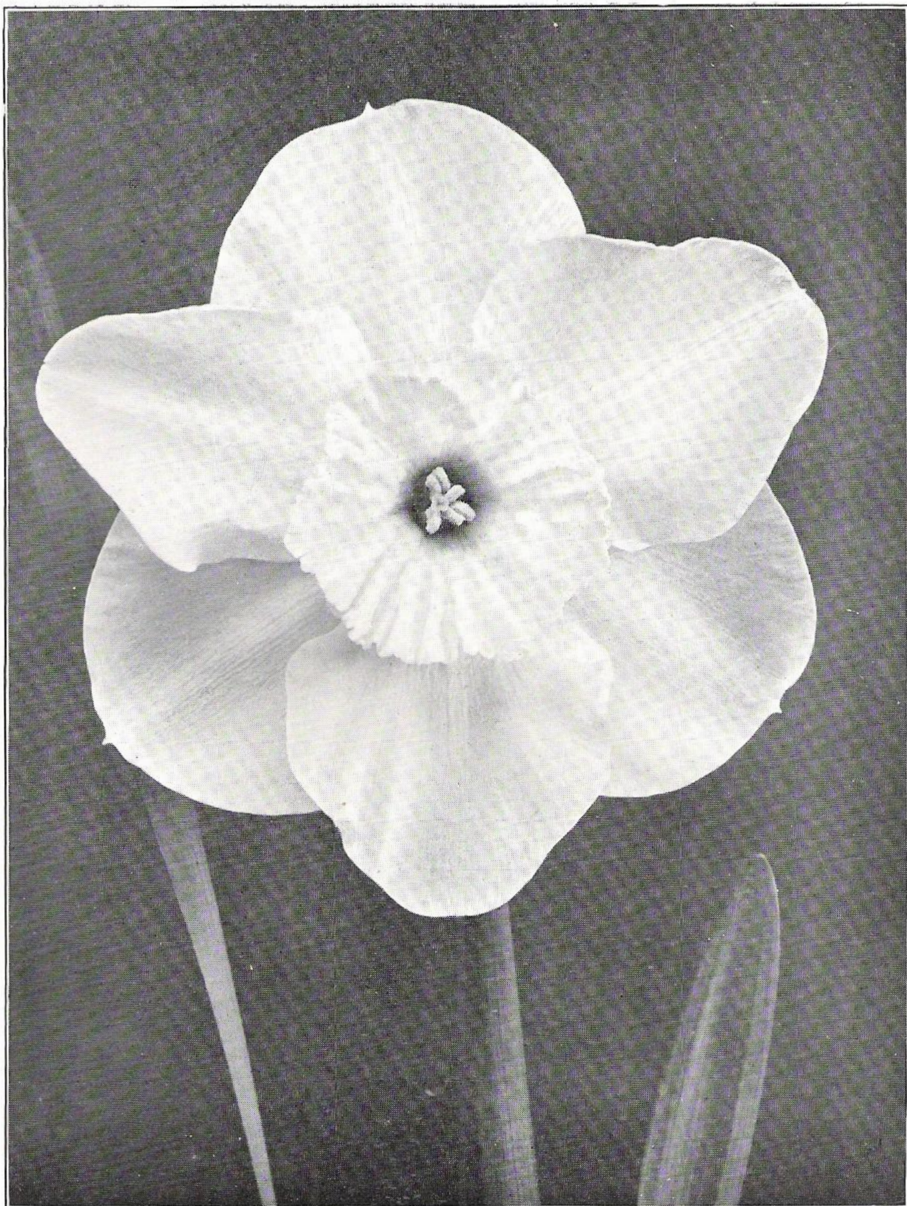
CHINESE WHITE, see page 26