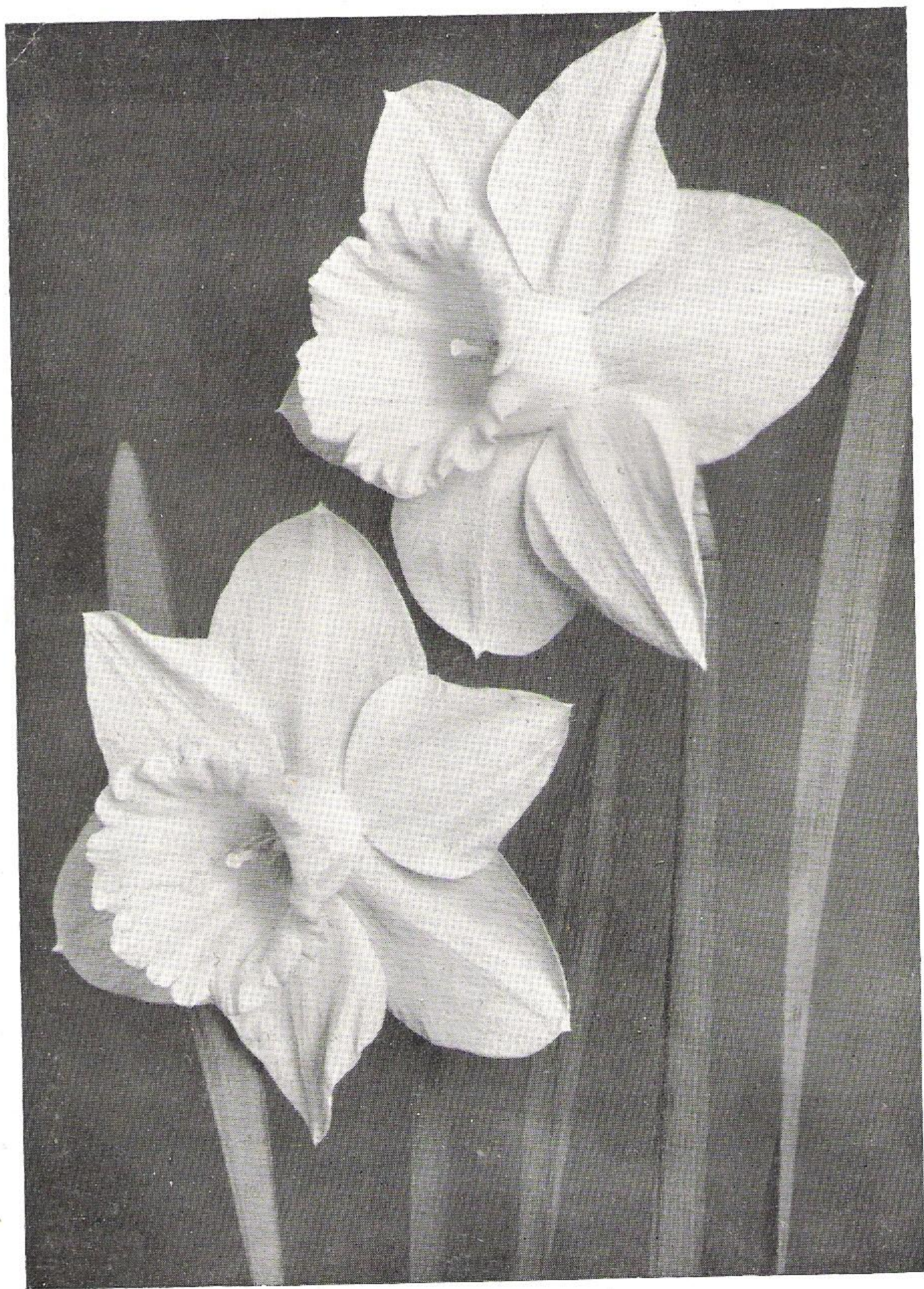
GOLDEN TORCH, see page 15