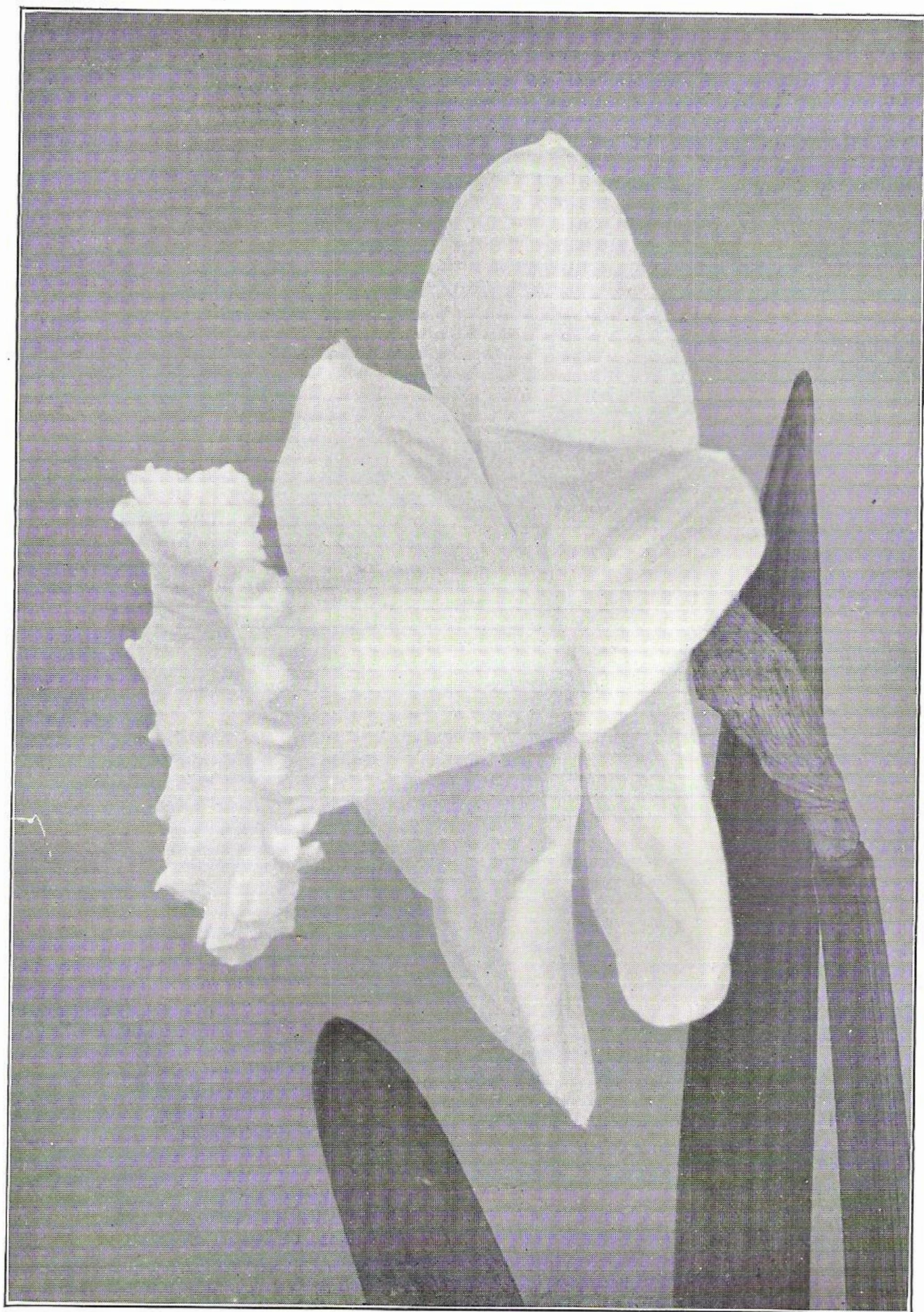
BROUGHSHANE, see page 12