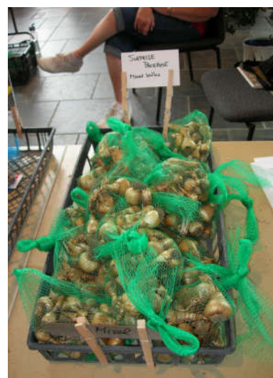
Mixed bulbs in a "Surprise Package"

We had very successful August sales - help us finish up for the season! We have mixed bulbs left, which we are selling as a "Surprise Package". They are great bulbs, we just don't know what they are!