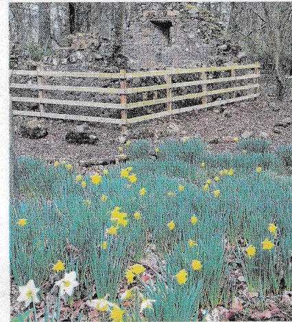
Clockwise from main: daffodils outside the walled garden; the path of cobblestones and crushed shells through a climber tunnel; young woodland; the ruin of a tomb; Narcissus Merkara; Duchess of Westminster; Sutton Court; a raised bed of rock plants