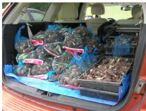
Just some of the bulbs from the 2017 Ellsworth dig - hoping you will help clean and bag them!

Want to help, but can't join us on Saturday, August 5th? We also need help cleaning bulbs prior to the 5th!