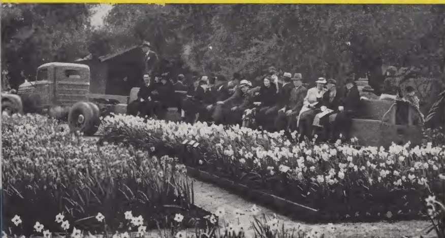
Sight-seeing bus on which our visitors are given a tour of our growing grounds at Niles.

Above all, this is our personal invitation to you to visit our Ninth Annual Outdoor Bulb Show in 1940.