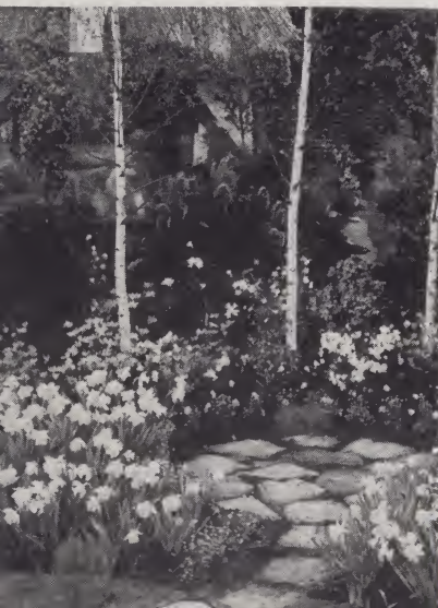
DAFFODILS UNDER BIRCH TREES CREATE A DAINTY PICTURE