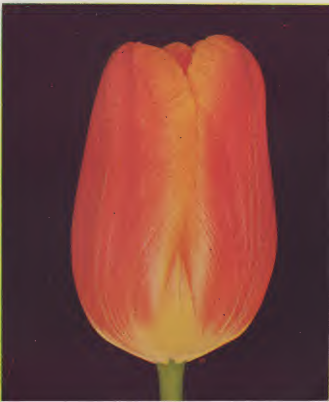
PRINCE OF ORANGE