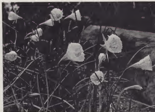
BULBOCODIUM CONSPICUUS (Hoop Petticoat Daffodil)