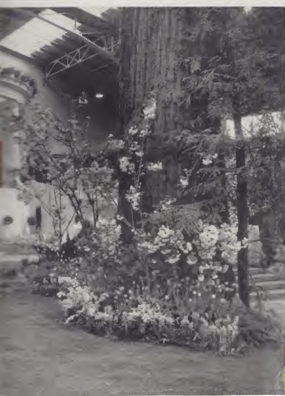
Part of our exhibit at California Spring Garden Show at Oakland, April, 1939.