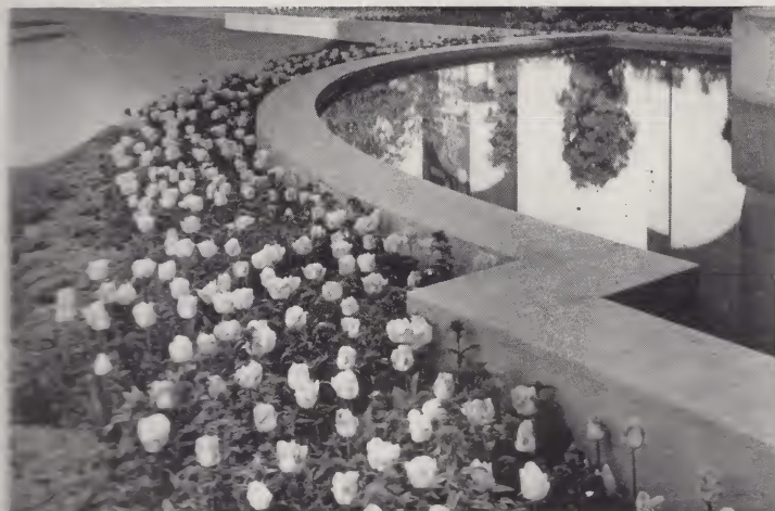
Tulips in Court of Reflections at the Golden Gate International Exposition.

WEBER (1). A new type of tulip (Mendel) as large as a Darwin, but earlier. The beautifully formed flowers are pure white with wide margins of clear pink. The marginal coloring is constant and does not spread as the flower ages, thus it retains its daintiness till the petals fall. 10 for 65c; 100 for $5.50.