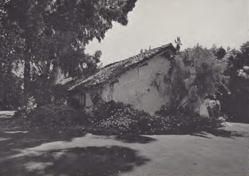
"Old Adobe", our century-old Guest Lodge and a center of interest for California flower lovers.