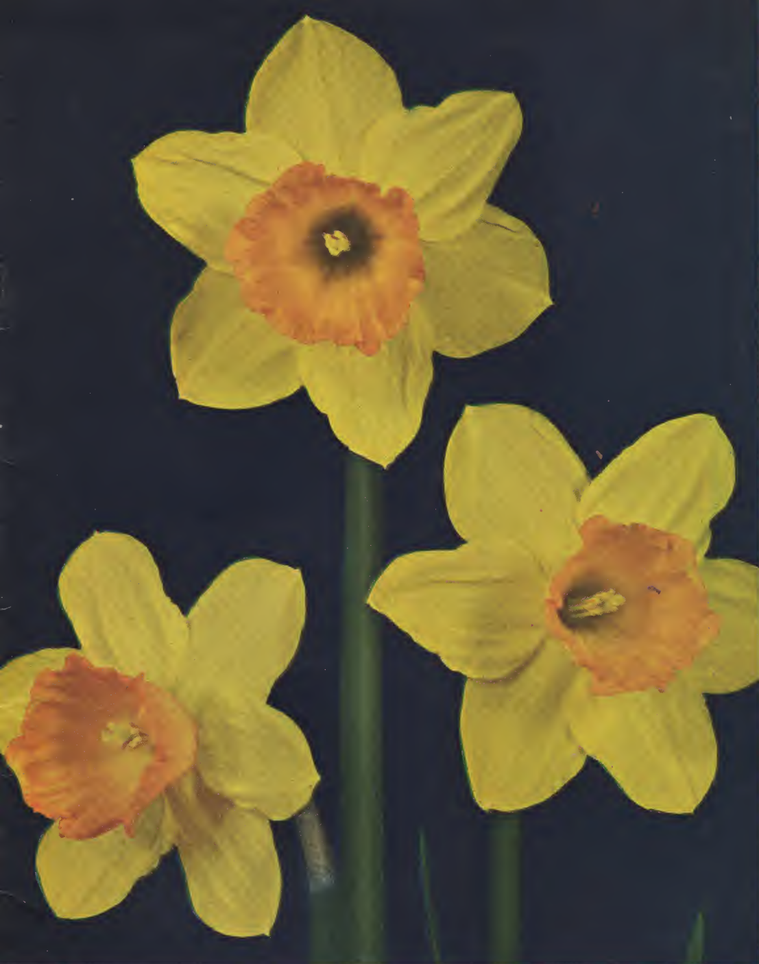
FORTUNE (See Page 4)

DAFFODILS • TULIPS DUTCH IRIS • HYACINTHS • ANEMONES RANUNCULUS • MISCELLANEOUS BULBS