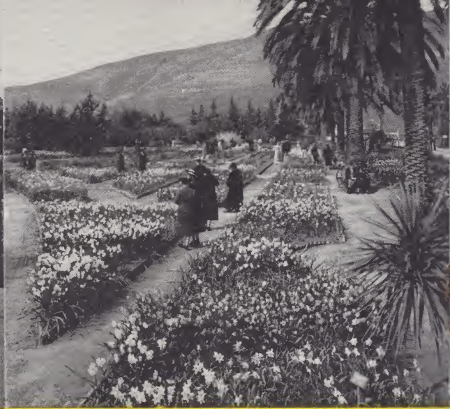
Our Daffodil Test Garden where the newest varieties are given a trial.