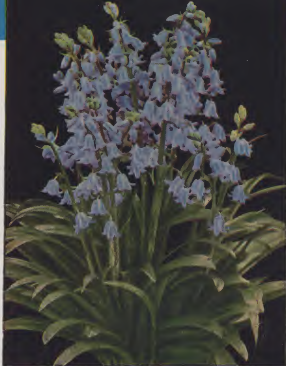
SCILLA CAMPANULATA EXCELSIOR