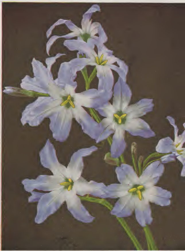
LEUCOCORYNE (Glory of the Sun)

Plant "Roeding Quality" bulbs and note the difference.