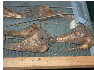
Help clean the dirt off bulbs and bag them for sale

and enjoy some company while working! It's easy, but dusty work (bring gloves). If you are not available on Saturday, August 1st, contact Jenn for other bulb cleaning & bagging options! (Jenn lives in Newport, just off Hwy 61/10, just south of I-494). Contact Jenn at 651-270-0281 - leave a message if you get voice mail. NO TEXTING!