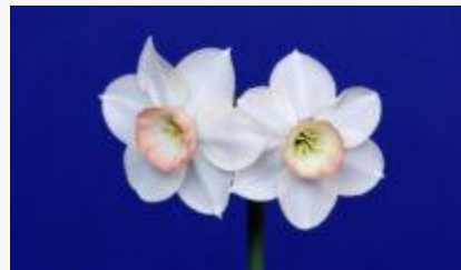
a Koopowitz Pink Petalled seedling.