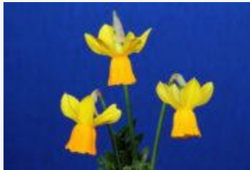
The Laurus award for the best 3 stem mini in the Hybridizers section. Exhibited by Esker Farms Daffodils. EF50 by Esker Farm Daffodils.