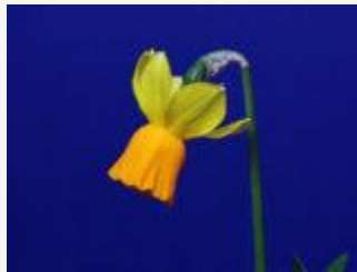
The Innovators Award. EF50 by Esker Farm Daffodils.