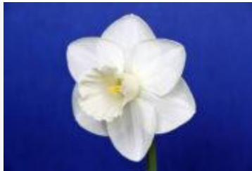
The Standard "Best in Show" was La Delicatesse, exhibited by Kirby Fong.