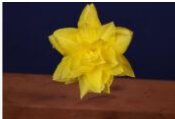
Best Historic Ribbon Winner

The Intermediates Section and standard collections are the areas examined for the best intermediate daffodil. An intermediate daffodil is a standard daffodil in Royal Horticultural Society divisions 1, 2, 3, 4, or 11 having a diameter typically greater than 50 mm and up to 80 mm. The winner was 'Mighty Might' 1YYG-Y exhibited by Jon Kawaguchi.