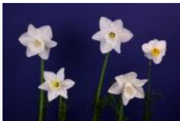
Historic Collection of 5 Ribbon Winner

The Container-Grown Section has classes for standard, miniatures, and species. Though not especially floriferous and very impressive looking, the winner in the standards class was 'Cornish King' 1W-Y exhibited by Terri Emmons.