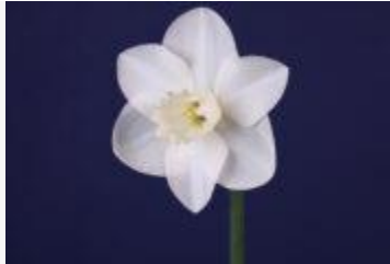
Gold Ribbon Winner

The Fortuna Garden Club held its 46th annual daffodil show March 25-26, 2023. Fortuna is near the coast in Northern California about a five hour drive north of San Francisco. Fifteen exhibitors put in 139 exhibits with a total of 366 stems. We'll go through the ADS award winners in the order in which they're listed in the show report. If an ADS award is not mentioned, it means there were no entries in the eligible classes for that award or that none of the entries was worthy of the award.