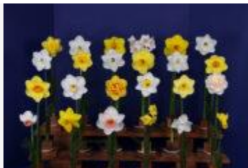
Carey Quinn Award Winner

The Quinn collection class calls for 24 standard daffodils from at least 5 RHS divisions. the flowers in the winning collection are: