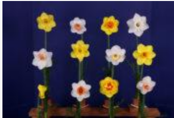
Marie Bozievich Ribbon Winner

Back: 'Fencourt Jewel' 8W-P, 'Jeu d'Amour' 2W-YPP, 'Alto' 2W-P; Front: 'Entrepreneur' 2W-GPP, 'Birky' 2W-P.