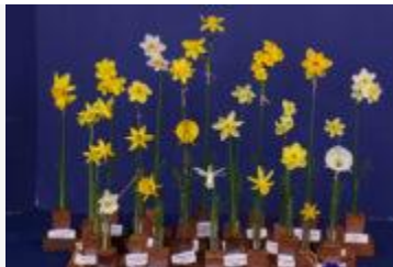
Harold Koopowitz Miniature Collection Ribbon Winner

The Koopowitz collection class calls for 24 miniature daffodils from at least 5 RHS divisions. Flowers in the winning collection are: