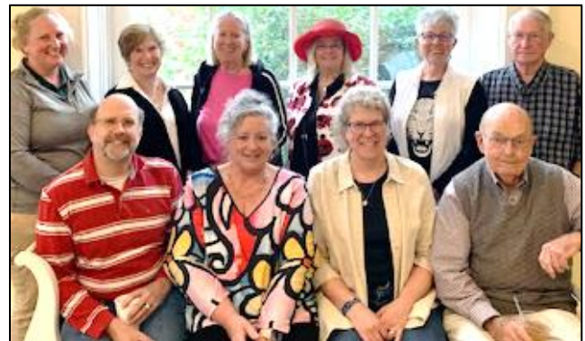
Lunch at the Ginter Garden Café.