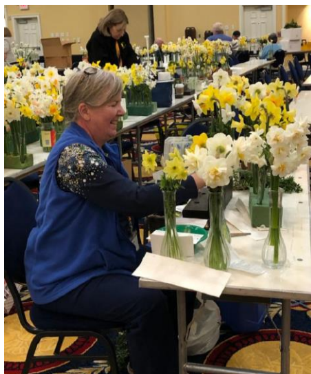
Staging flowers for the show: