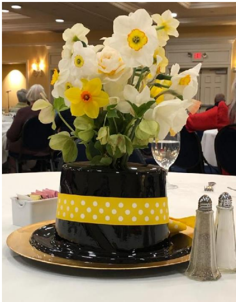
We had great table decorations which were the creations of Glenna Graves. Thank you so much they were very special.