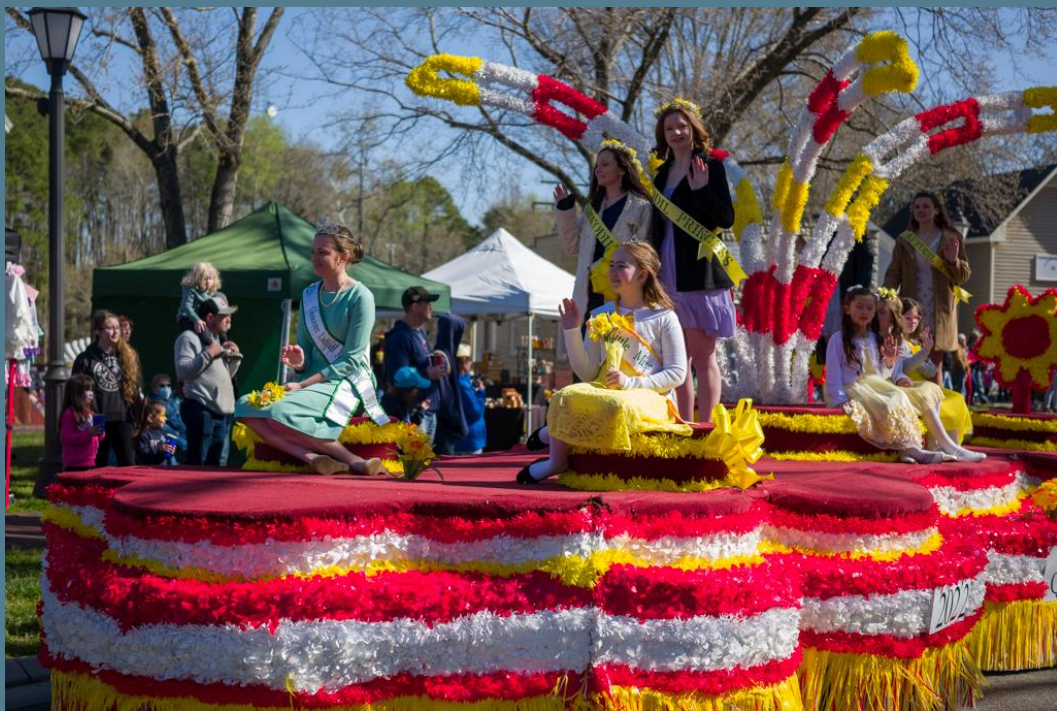
The Royal juggernaut.