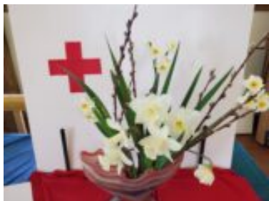
Garden Club arrangement of tribute to the red cross.