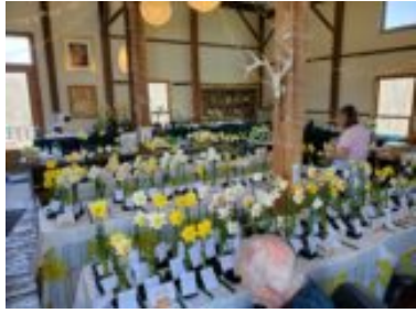
The show, just about ready for judging.