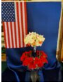
Garden Club tribute to America.