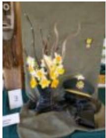
Garden Club tribute to military heros.