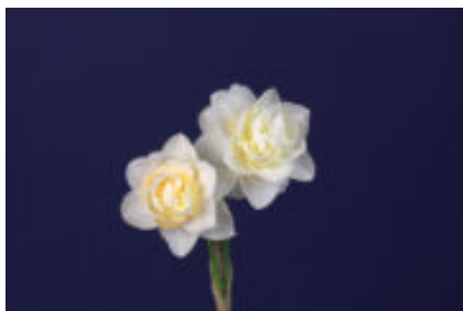
Miniature Gold Ribbon and Miniature Rose Ribbon Winner

As in the post on the standard awards, we'll go through the miniature awards in the order in which they appear in the official show report. If an award is not mentioned, it means there were no entries, the award was not given, or the award was not offered.