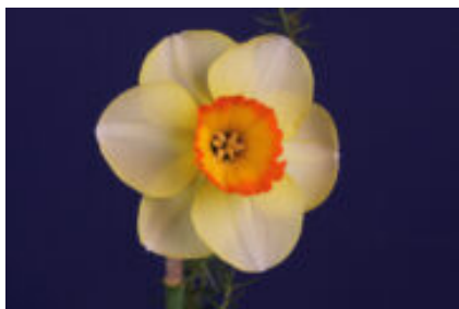
Best Intermediate Ribbon Winner