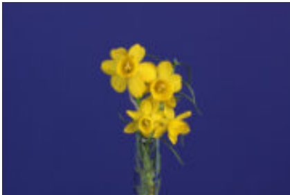
Miniature Gold Ribbon Winner

The Gold Ribbon is awarded to the best standard daffodil in the show excluding the container-grown classes. The winner was 'WOW!' 1Y-Y exhibited by Kirby Fong.