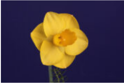
Gold Ribbon Winner

The 2022 Fortuna daffodil show was March 26-27 at River Lodge in Fortuna, a city near the coast about a five hour drive north of San Francisco. Various conditions conspired to make this year's show smaller than usual, and you'll see signs of prolonged storage in some of the exhibits shown below. There were 141 entries by 13 exhibitors for total of 354 stems. We'll go through all the ADS award winners in show report order. If an award is not mentioned, it means it was not awarded or there were no entries.