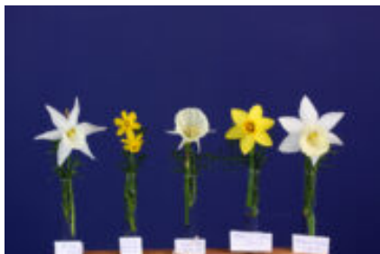
Lavender Ribbon Winner

The Quinn collection class calls for 24 different standard daffodils from at least 5 different Royal Horticultural Society divisions. The winning collection consisted of: Top row: 'Ballistic' 4Y-O, 'Fencourt Jewel' 8W-P, 'La Delicatesse' 2W-W, 'Purshull Green' 3W-Y, 'Gay Tabor' 4W-O, 'Cape Cornwall' 2Y-YYO; 3rd row: 'Bramcote Jewel' 1W-Y, 'Alto' 2W-P, 'Churchfield Bells' 5Y-Y, 'Hot Choice' 3Y-R, 'Bramcote Gem' 1W-Y, 'Euphonic Bells' 5W-W; 2nd row: 'Eagle Lake' 2W-Y, 'Lumen Lemon' 3Y-Y, 'Qiyanna Raine' 4Y-O, 'Pacific Rim' 2Y-YYR, 'American Classic' 2Y-WYY, 'Birky' 2W-P; Bottom row: 'Hot Circle' 3WWY-YYO, 'Foundling' 6W-P, 'Killearnan' 3W-GYR, 'Lesley' 3W-Y, 'Royal Regiment' 2W-O, 'Golden Echo' 7WWY-Y. The exhibitor was Kirby Fong.