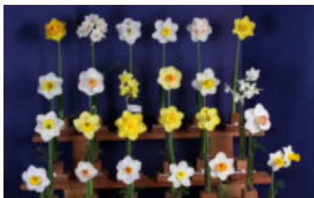
Carey E. Quinn Award Winner

The Purple Ribbon is for the best collection of 5 standard daffodils in the show. The winner was a Division 2 collection consisting of: Back: 'Cape Cornwall' 2Y-YYO, 'Pacific Rim' 2Y-YYR; Front: 'Alto' 2W-P, 'Cameo Lady' 2W-W, 'Birky' 2W-P. The exhibitor was Kirby Fong.