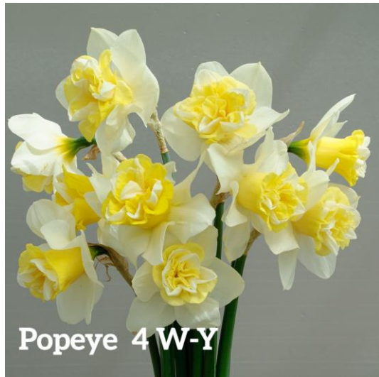
Popeye 4 W-Y