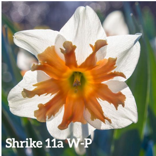
Shrike 11a W-P