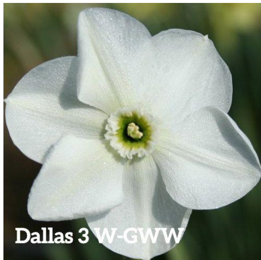
Dallas 3 W-GWW