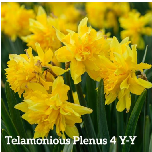
Telamonious Plenus 4 Y-Y