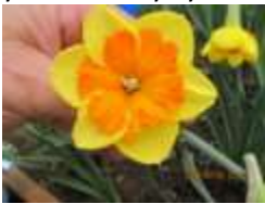
Slit Atom 11a Y-O. A very popular Div 11. Wins many Blue ribbons. It is both seed and pollen fertile.