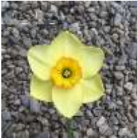
Green Eyed Beauty – One of the best Nial Watson introductions. A big show winner in Northern Ireland. It is both seed and pollen fertile. 1 st year to be offered.