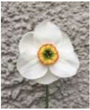
Poets Day 9-GYR. I bought the stock of Poets Day in 2018. It failed to bloom until 2021 after I moved it to the back 40 daffodil beds. Now that it is a proven bloomer it is being offered for the 1 st time.