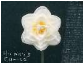
Hilary's Choice 4W-O. One of the best Nial Watson introductions. It must be great if you name it after your spouse. If you like very symmetrical Division 4's this one is for you. 1 st Time offered for sale. It is pollen fertile.