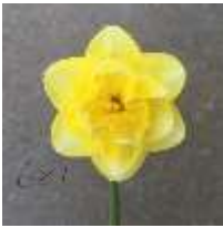
Lemon Flounce – Breed and Grown in 2020 by Nial Watson. It is seed fertile.