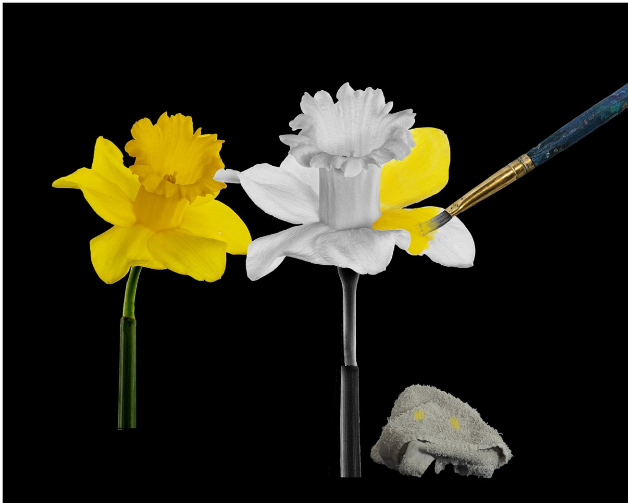
Class P5 – Daffodils from Another Point of View