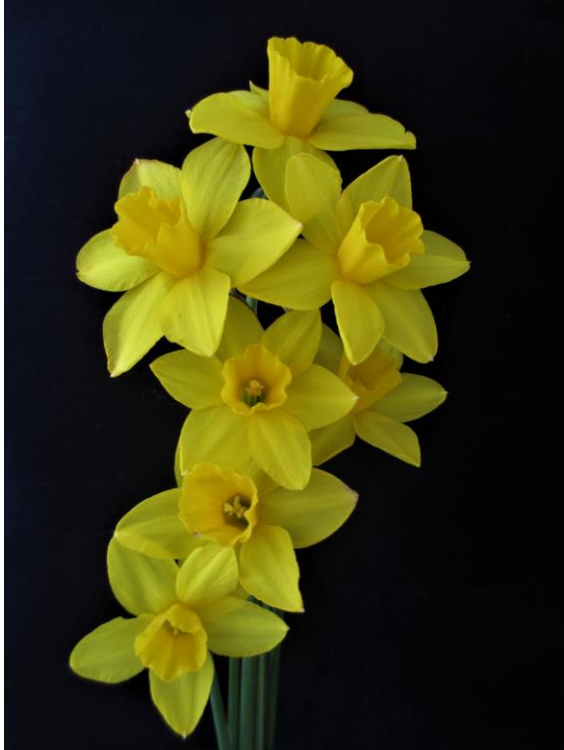
Class P2b Daffodil Portraits: Multiple Florets P2b – First Place – ‘Golden Seven’, ‘Sweetness’ 7 Y-Y Melanie Paul, Hampton, Virginia

The results of these shows are still available for viewing on-line. Direct your browser to the ADS Website dafflibrary.org , navigate to ADS Show Results/Mid-Atlantic Photography Show. Also check out the Garden Club of Virginia Daffodil Days show, it is excellent. Both are lovely harbingers of a gardening future, a virus free connection without the need of masks.