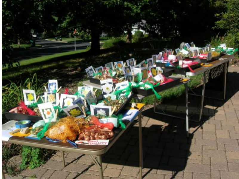
The annual Bulb Roundup features great bulbs! Volunteer during the year and yours will be FREE!

where members can pick the minds of experienced daffodil growers, all while selecting wonderful bulbs. Volunteer during the year and you will be among those getting first-pick!