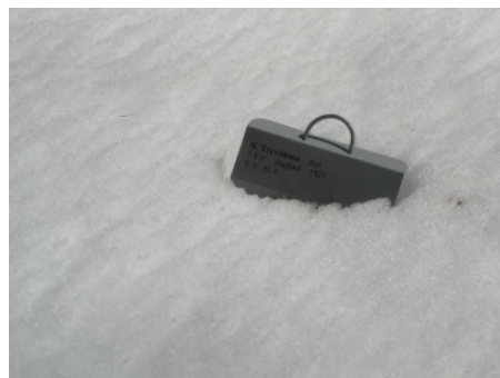
Daffodil tags appear as the snow melts!

Spring Show - Celebrate spring with daffodil blooms and photographs!