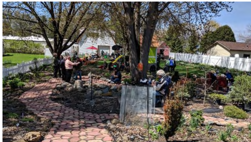
We toured Jenn Lanz's "Wonderland Garden" - indeed wonderful!

The Daffodil Society of Minnesota is incorporated as a 501(c)(3) tax-exempt, non-profit educational organization.