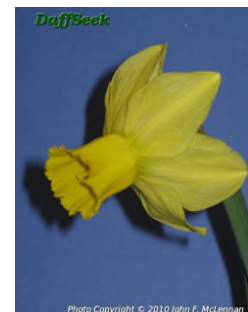
Charity May 6 Y-Y