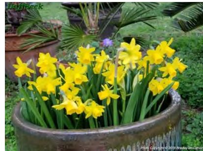
Tete-a-Tete 12 Y-Y You have seen it in many florists' pots!