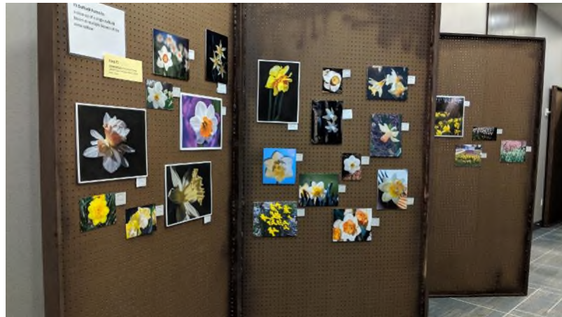
Over 100 photos were entered, including several by local members