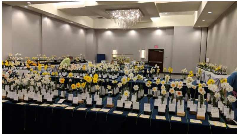
In spite of the late spring here in Minnesota, the show room was full of blooms brought from elsewhere in the country!