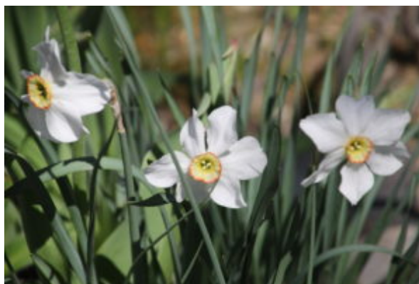
Narcissus ‘Pheasant’s Eye’ naturalize in a garden setting.

His 1 ½ acres of planted land is a bevy of beauty.