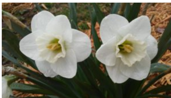
Narcissus ‘Bierglass’ found in Frank Nyikos’ garden.