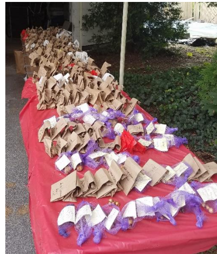
Table-full of exchange bulbs