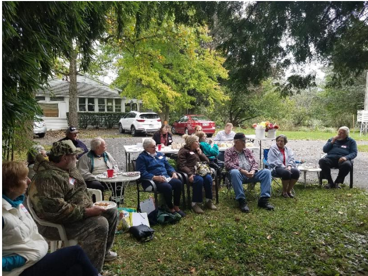
2018 Fall meeting

It's amazing how tough winter bulbs are under the snow. We had snowdrops in bloom followed by weeks of snow cover. When the snow finally melted, there were the snow drops still blooming. As the snow melts it provides a slow even watering to the bulbs below. Even crocus, winter aconite and daffodils are growing under the snow, protected from the cold temperatures above.