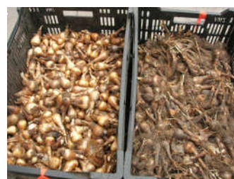
Freshly dug daffodil bulbs - after cleaning and before!

DSM has many fun events for members and the general public. Check out the entire 2019 DSM calendar here!