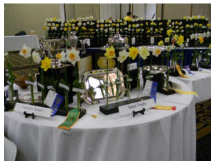
Every National Show features awards for large collections, as well as individual blooms

The American Daffodil Society's annual National Convention and Show is May 2-5, 2019, right here in Bloomington - plan to come! And consider entering this year, even if you've never done it before. If you are new to exhibiting, we will give you all the help you need to learn how!