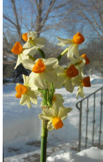
One way to shake the winter blues is by 'forcing' daffodils!

You! All DSM members are invited and encouraged to attend. Put Sunday, January 27, 1:00 PM on your calendar! The Annual Meeting will be immediately followed by a Convention Planning meeting. We would love to have you join us for both. Click here to let us know you're coming!