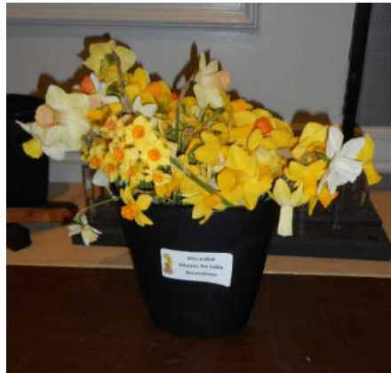
There are always leftover blooms, available to make table centerpieces!

Set up and staff the Boutique - Thursday, Friday, and Saturday, May 2nd thru 4th.