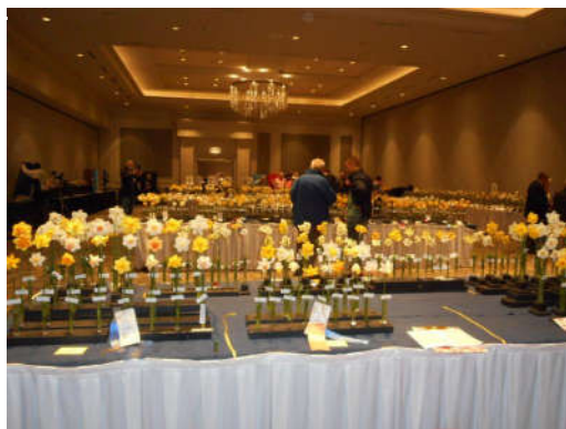
2018 National Convention in Nashville, TN

two final convention planning meetings. We will be finalizing details for the ADS National Convention & Show.