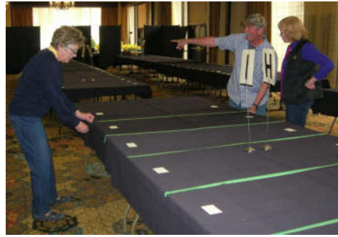
Help set up tables to display flowers

Volunteers are needed for many different tasks before and during the convention. Here are just a few ways you can help. Let us know what tasks you can help with!