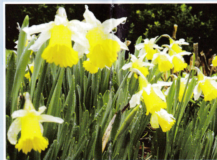
Bambi - Early Flowering