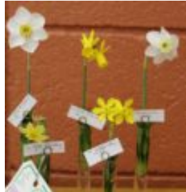
Back row: Little Kibler 9; Little Becky 12; Segovia 3: