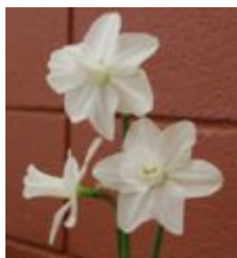
The Purple Ribbon was the Division 2 Collection. I did not get the name of the exhibitor or the picture.