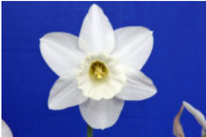
The Classic Cultivar was Panache, from the 5 stem Classic collection. exhibited by Mike and Lisa Kuduk