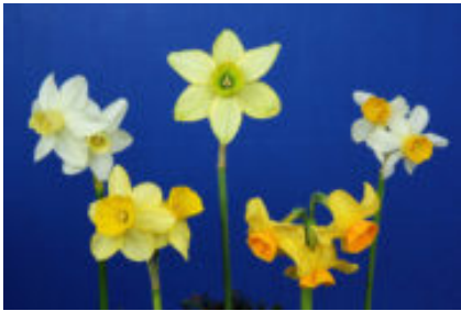
A very nice division 12 collection of 5 by Kathleen Simpson