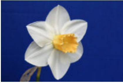
Profile of the Rose and Gold Ribbon Winner.