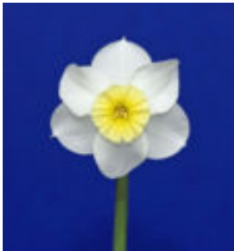
The Mini Gold for best single stem mini in show was exhibited by Naomi Liggett. Yellow Xit.