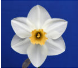
The Gold and Rose ribbons. All American X Geometrics. Registered this week with the name of "Margaret's Grace".