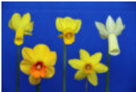
The Purple Ribbon winner for the best 5 stem entry of standard daffodils in the show. Exhibited by Clay Higgins, the flowers from top right are: Rapture, Waynes World, Lemon Silk, Arrow Head, and Itzem.