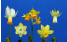
The Red White & Blue Ribbon winner for the best collection of 5 american bred Daffodils in the show. Exhibited by Lynn Ladd, the flowers were: Stony Brook, Canyon Wren, Lavalier, Intrigue, and Skaters Waltz.