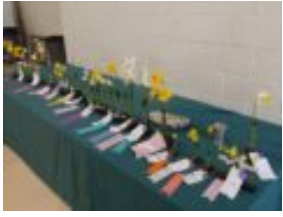
Georgia Daffodil Society Show Trophy Table