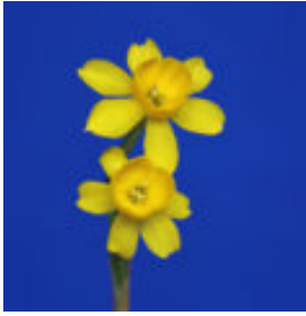
The mini rose ribbon for the best miniature seedling (un named new hybrid) in the show. Exhibited by Becky Fox Matthews