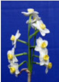
The Classic single stem & Classic Cultivar, Avalanche, exhibited by Bonnie Campbell.