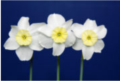
The Mini White ribbon for the best 3 stem mini in show. Segovia by Diane Daleuski Cockerham