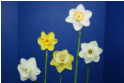
Red White and Blue by JR Blanton with flowers of: Colonial White, Sun & Moon, Beauty Tip, Ole' and Fox Fire.