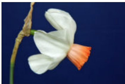
The Rose Ribbon for the best seedling in show. Milestone Open Pollenated.