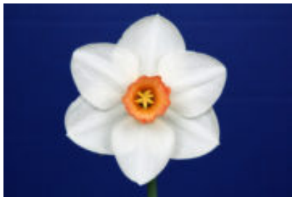
The Intermediate single stem winner, Pink China.