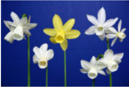
The Purple Ribbon for the best 5 stem standard collection in show was Sara Kinne's nice div 5s collection.