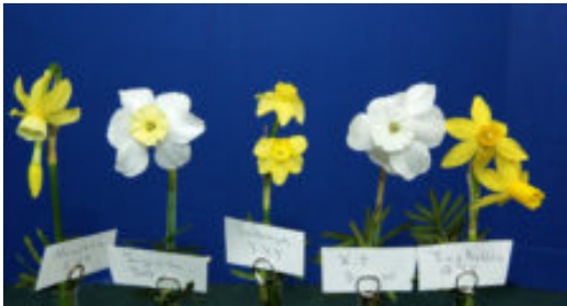
The Lavender Ribbon winner for the best 5 stem mini in show. Exhibited by Jean Lager with the flowers of: Hawera, Segovia, Sabrosa, Xit & tiny bubbles.