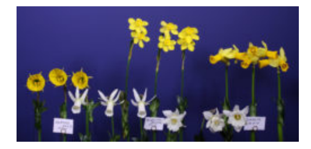
Miniature Bronze Ribbon

The Twelve Miniatures by Hybridizer Ribbon is for the best collection of 12 different miniature daffodils hybridized and originated by the exhibitor. Flowers in the winning collection are: Top row: 2012-037-1 12W-W, 2012-085-2 7Y-W, 2007-024-1 2P-P, 2012-101-1 8W-W, 2008-078-1 2Y-R; Middle row: 1999-114-5 2W-P, 2006-036-1 5Y-Y, 2012-017-1 12Y-Y, 2011-134 8W-W; Bottom row: X-34-2 11aY-O, 2009-078-1 12Y-O, 'Itsy Bitsy Splitsy' 11aY-O. The exhibitor was Harold Koopowitz.