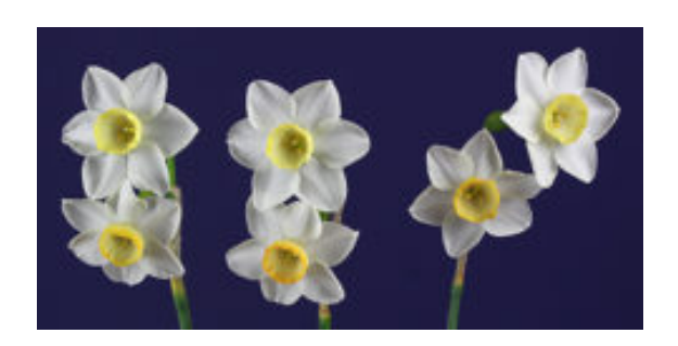
Miniature White Ribbon winner

For people interested in growing, showing, or hybridizing daffodils. https://daffnet.org