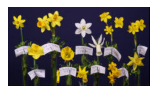
Roberta C. Watrous Award

For people interested in growing, showing, or hybridizing daffodils. https://daffnet.org