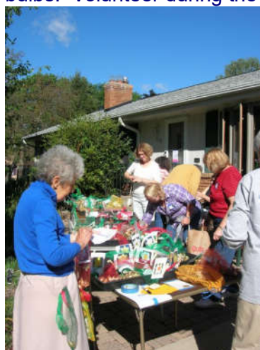
DSM members enjoying the 2016 Bulb Roundup

Then in September we'll have the members-only Bulb Roundup , where members can get pick the minds of experienced daffodil growers, all while picking out wonderful bulbs. Volunteer during the year and you will be among those getting first-pick!