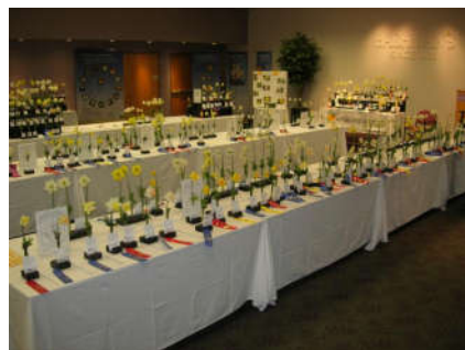
This is the year to participate in a daffodil show!

The 40th Annual Daffodil Show at Bachman's is in five short weeks, May 5-6-7, 2017! We welcome daffodil and photography entries from all , and we will help you enter them if you've never done this before. Contact the show chair for information about entering your blooms or photos in the show!