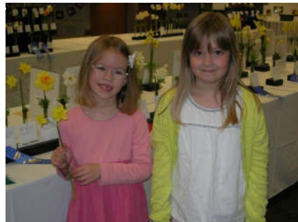
Your child or grandchild can win special awards!

The show has special classes and awards for small and new growers (under 50 varieties in your garden), as well as specific classes and ribbons for youth (age 18 and under)! Invite your children, friends, or grandchildren to enter blooms and/or photographs as well. DSM membership is not required! Email for details, or check out the Show Schedule for tips.