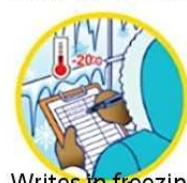
Writes in freezing temperatures.