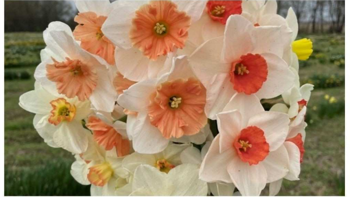
2022 PHS Daffodils