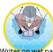
Writes on wet paper (and daffodil stems)