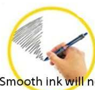
Smooth ink will not wash off in water.