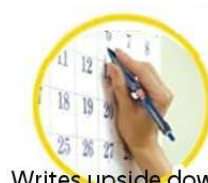
Writes upside down.

The best, the very best, pens to use on daffodils stems when picking for show are the Power-tank pens by Uniball . Sue presented all members with a special Power Tank pen, a useful pen that will write on wet paper or a daffodil stem and the ink will not wash away. Cherish it!