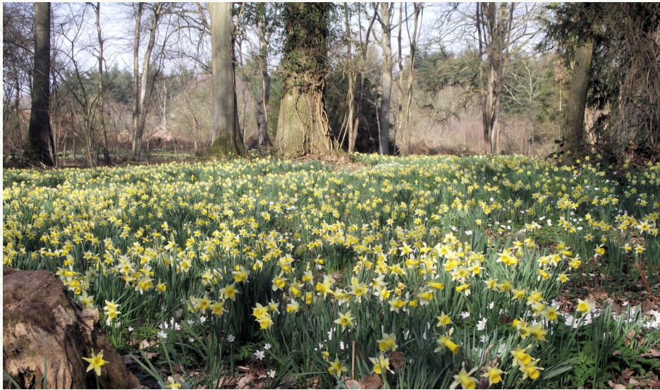
Above: Over one hundred years later, N. pseudonarcissus is still naturalized in Dymock Woods, Gloucestershire, Eng.