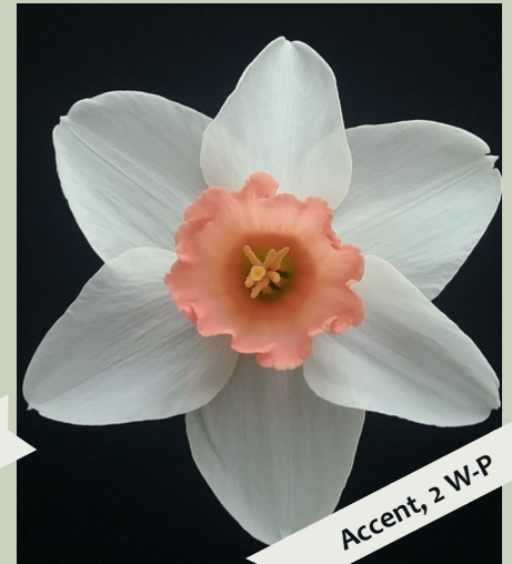
Accent, 2 W-P