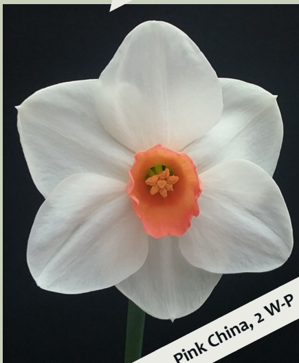
Pink China, 2 W-P