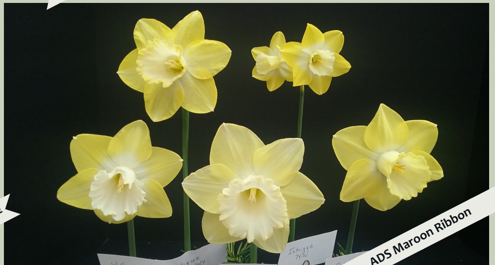
ADS Maroon Ribbon