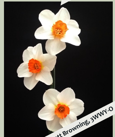
Barrett Browning, 3WWY-O