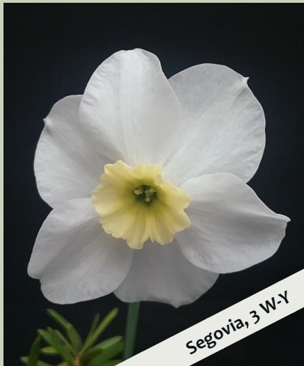
Segovia, 3 W-Y