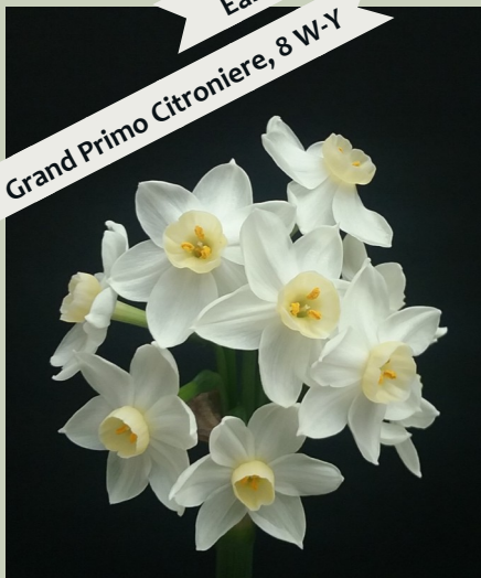
Grand Primo Citroniere, 8 W-Y