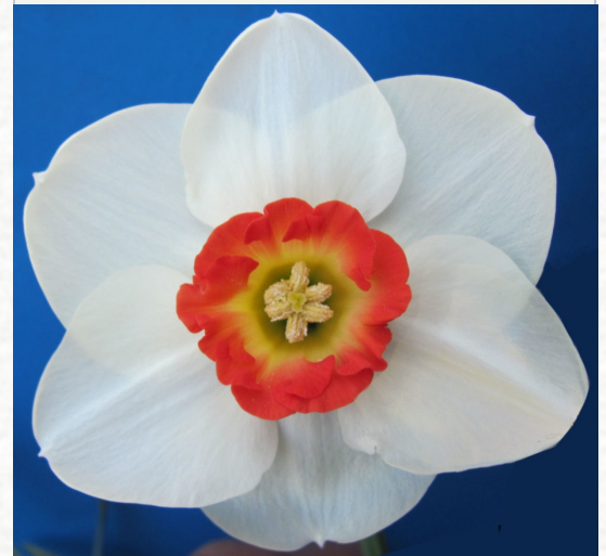
Strawberry Ruffles, 3 W-GYR Larry Force. 2015, Intermediate.