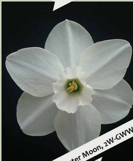
Easter Moon, 2W-GWW