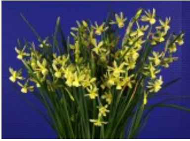
Miniature Container-Grown Ribbon

The best miniature grown and shown in a container was 'Hawera' 5Y-Y exhibited by Ray Rogers.