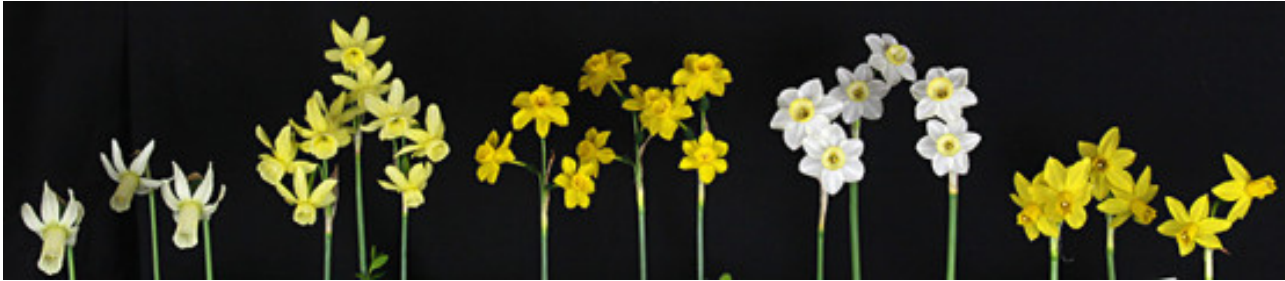
Miniature Bronze Ribbon

Bottom row: 'Hummingbird' 6Y-Y, N. rupicola ssp. watieri 13W-W, N. triandrus ssp. triandrus var. concolor 13Y-Y.