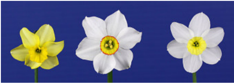
Three Miniatures by Hybridizer Ribbon

The Miniature Bronze Ribbon is for the best collection of three stems each of five different miniatures from at least three RHS divisions. Exhibitor of the winning collection was Kathryn Welsh. The flowers are: 'Snipe' 6W-W, 'Hawera' 5Y-Y, 'Twinkling Yellow' 7Y-Y, 'Shillingstone' 8W-W, 'Tiny Bubbles' 12Y-Y.