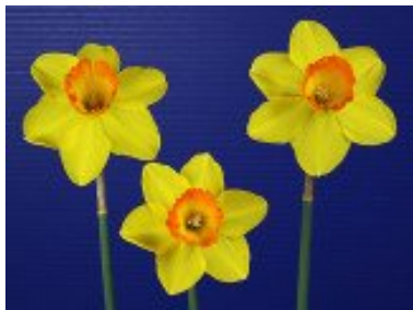
Youth 3-Stem Ribbon Winner

The best set of 3 in the Youth Section was 'Ceylon' 2Y-O exhibited by Devon Oase.