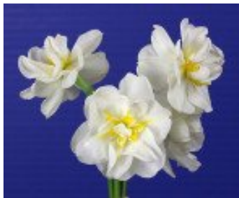
Small Grower Ribbon Winner

The best set of 3 in the Youth Section was 'Ceylon' 2Y-O exhibited by Devon Oase.