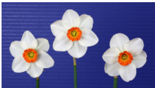
White Ribbon and Intermediate 3-Stem Ribbon Winner