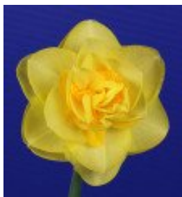
Gold Ribbon Winner

The 2016 Murphys daffodil show (March 19-20) was once again held at Kautz Ironstone Vineyards simultaneously with the town's Irish Day celebration. (The Murphy brothers were Irish.) We had 295 entries and 567 stems from at least 13 exhibitors. Due to the early bloom season, this relatively late show was smaller than in previous years. Here are the ADS award winners that involved only a single cultivar.