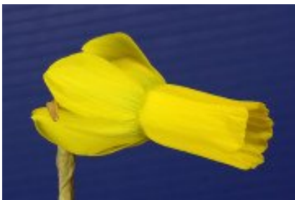
Youth Best Bloom Ribbon Winner