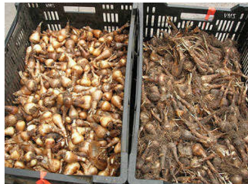
Bulbs - after cleaning and before

Want to help, but can't join us on August 6th? We may need help cleaning bulbs prior to the 6th!