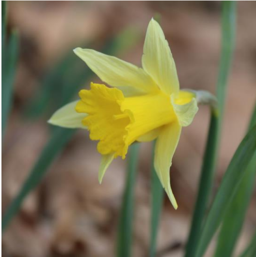
N. pseudonarcissus species Brentwood, TN, February 16, 2022