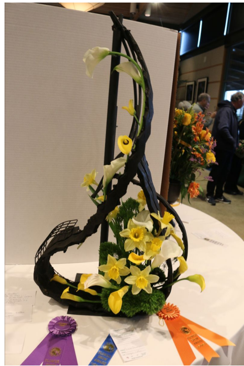
A top winner at the daffodil design show when we visited the Dallas Botanical Garden. The solid black material is a torn up tire tread!