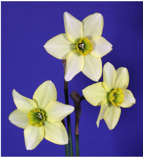
White Ribbon (Best set of 3 standard daffodils) 'Mesa Verde' 12G-GGY exhibited by Larry Force.