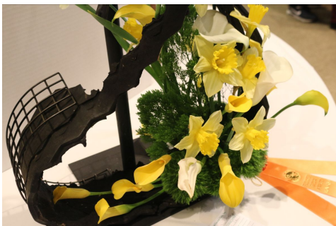
A close-up of the unique design winner