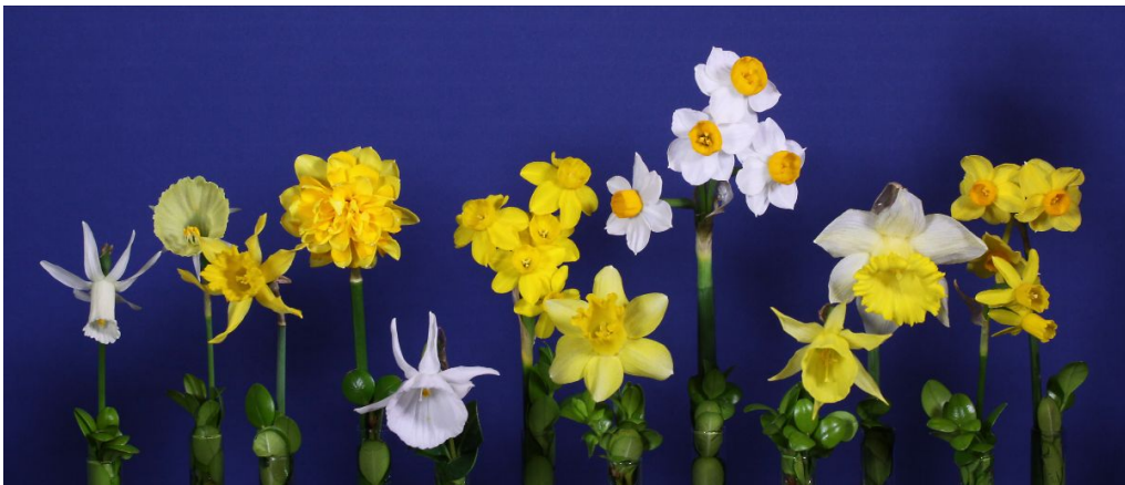
Roberta Watrous Award for 12 different miniature daffodils from at least 3 RHS Divisions. Back: 'Mitimoto' 10W-Y, 'Tête Bouclé' 4Y-Y, N. fernandesii 13Y-Y, 'Odoratus' 8W-Y, 'Little Beauty' 1W-Y, 'Beesknees' 8Y-O; Front: 'Snipe' 6W-W, N. minor var. pumilus 13Y-Y, 'Giselle' 10W-W, 'Punk' 1Y-Y, 'Fat Rascal' 12Y-Y, 'Busbie' 12Y-Y. Exhibited by Janet Hickman.

Copyright © 2020 Middle Tennessee Daffodil Society, All rights reserved.