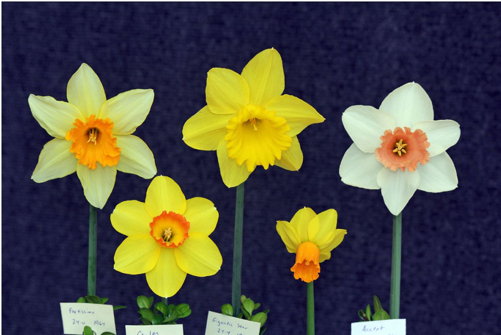
The best collection of 5 classic daffodils consists of: Back: 'Fortissimo' 2Y-O (1964), 'Gigantic Star' 2Y-Y (1960), 'Accent' 2W-P (1960); Front: 'Ceylon' 2Y-O (1943), 'Jetfire' 6Y-O (1966). The exhibitor was Karla McKenzie. The 'Jetfire' was the best bloom in the Classics Section.