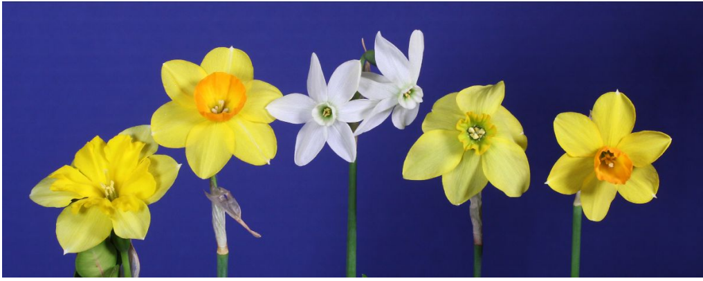
Miniature Red-White-Blue Ribbon (best collection of 5 miniature daffodils of American breeding) and Lavender Ribbon (best collection of 5 miniature daffodils 3001 11aY-Y, 3002 2Y-O, 3003 7WWG-GWW, 3004 2Y-GYY, 3005 2Y-O. Exhibited by Bob Spotts.