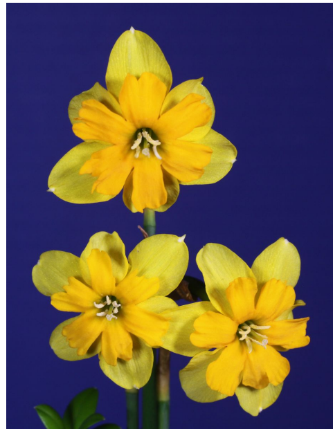
Miniature White Ribbon 'Itsy Bitsy Splitsy' 11aY-O exhibited by Jon Kawaguchi.